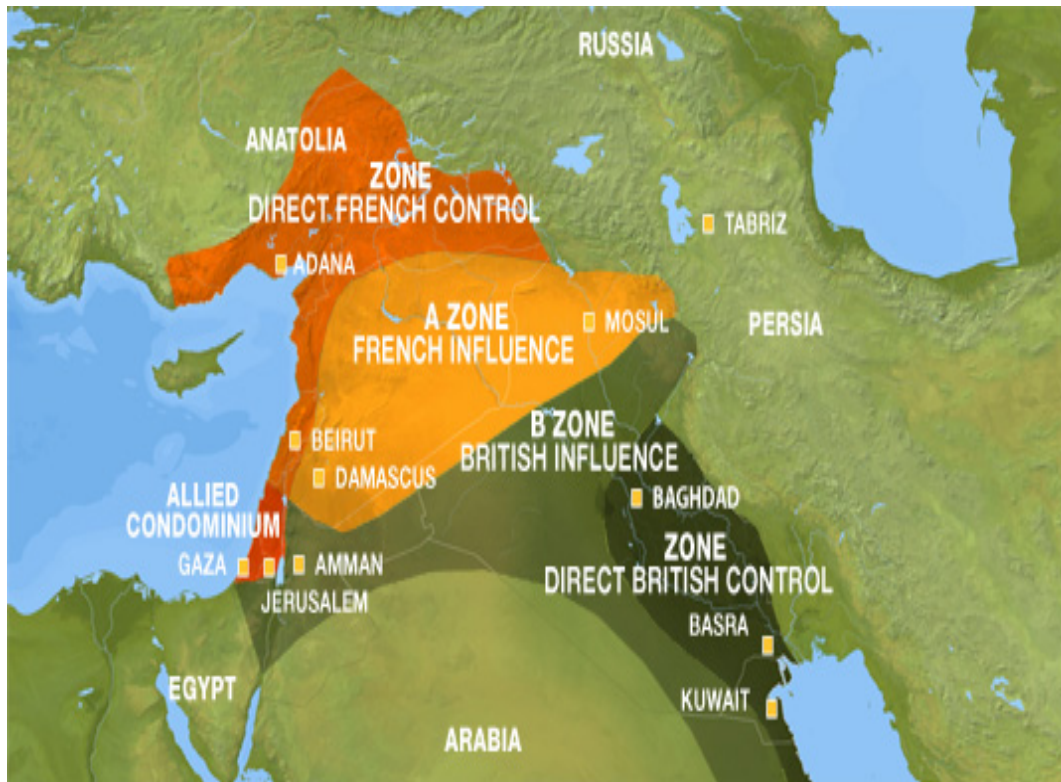
Figure 3. Sykes-Picot Boundaries of 1916