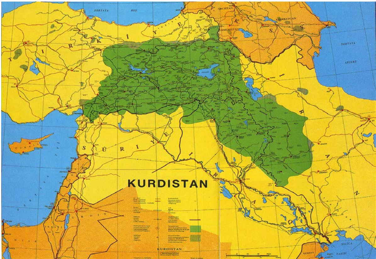
Figure 5. Boundaries of Kurdistan as recognized by the Kurdish Institute of Paris, 2016.

Kurdistan provides the greatest stability for all Kurds in the region, a virtual safe haven. The semi-autonomous region forms a link between the Kurds of eastern Turkey and those in southwest Iran. Following the first Gulf War and Operation Provide Comfort, the Kurdish borders within Iraq remained constant from 1992 until 2004. The semi-autonomous region of Kurdistan supports the Kurdish populations in both Turkey and Iran, while maintaining influence in Syria.