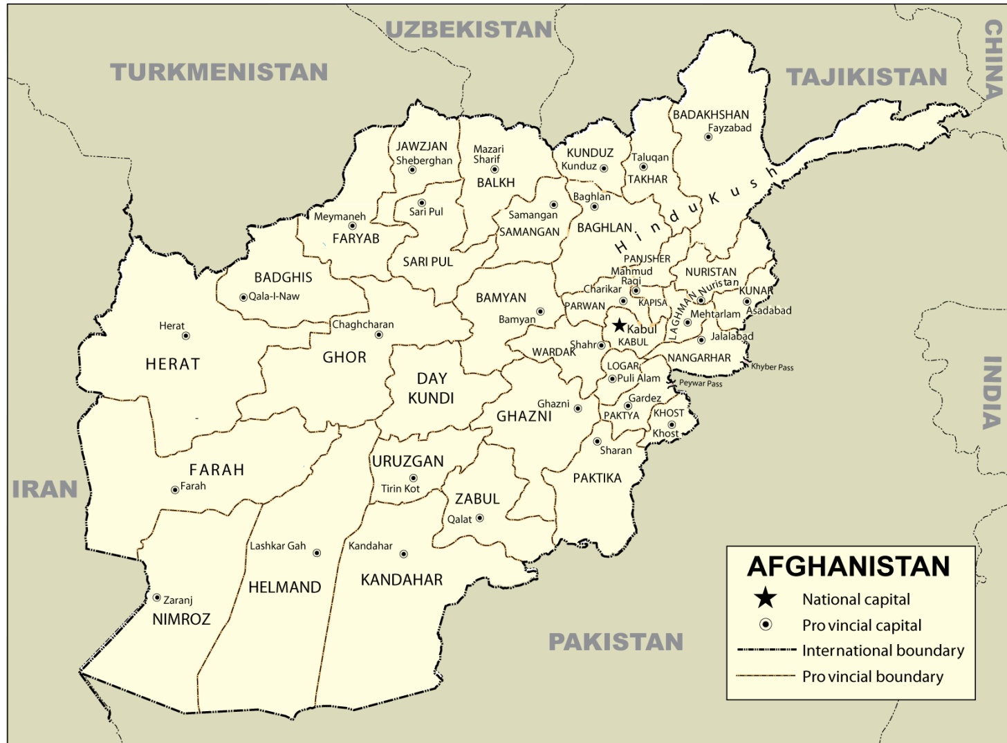
Figure I. Map of Afghanistan