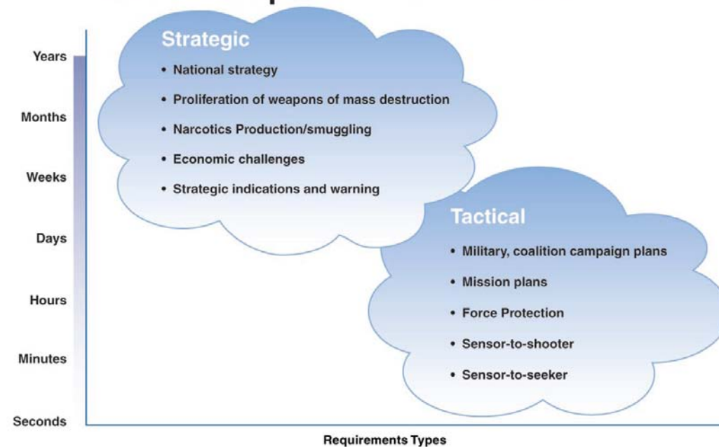
Figure 2: Strategic vs. Tactical Timeliness Differences