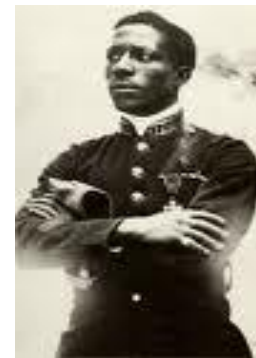
Picture 1 “Bullard” French uniform. Please note the collar insignia that indicates his assignment to the 170 th French unit. The photograph is circa 1917.

In Paris, on leave for his wound, he made a $2,000 bet with an American friend that he could join the French flying corps and become a pilot. Excited about the challenge, Bullard earned his wings from the aviation school: this made Bullard the very first Black combat fighter pilot in history. In August 1917, American pilots in France were invited to join the U.S. Army Flying Corps. 6 Bullard applied and passed the medical exam, but was denied. Bullard stated, “I was determined to do all that was in my power to make good, as I knew the eyes of the world were watching me as the first Negro military pilot in the world.” 7 The only Black American in the French air force, Bullard flew more than 20 missions against the Germans, fought in many dogfights, and shot down at least five enemy aircraft, certifying him as an “ace.” 8