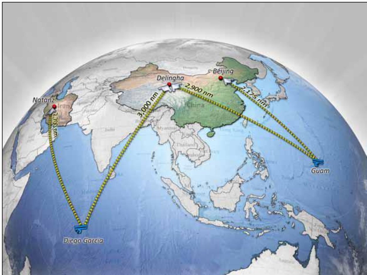
Figure 1. Representative ranges from Diego Garcia and Guam. 14

in an urban environment is just as important as integrating those required to conduct a deep strike against a fixed target. To overcome the A2/AD challenge, a new bomber must be capable of achieving at least 2,500NM combat radius to reach the majority of targets of interest (Figure 1). In addition to being highly survivable to penetrate future A2/AD environments, it must also persist to hunt mobile targets (Figure 2 & 3).