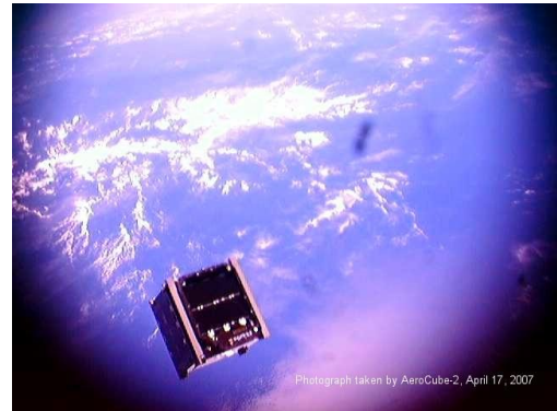
Figure 4: CubeSat CP4 from California Polytechnic Institute is photographed by AeroCube-2 shortly after the satellite was ejected into space. (Thomsen, 2009)

Second, CubeSat redefined the approach to building satellites through the development of standard building modules and taking advantage of the latest breakthroughs in nanotechnology. This approach makes