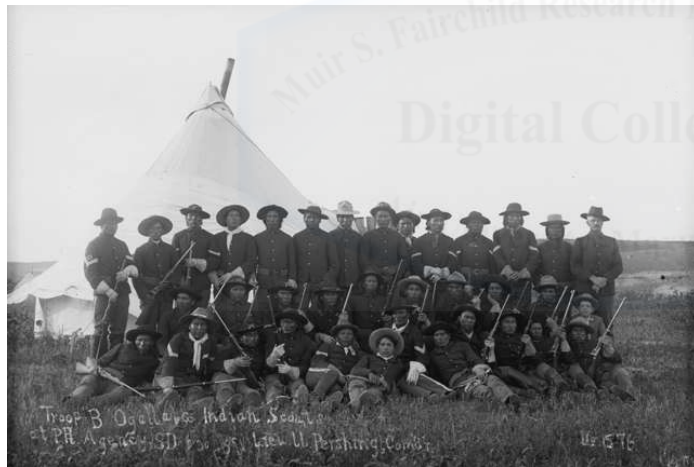
Lt. Pershing and Troop B Ogallala Indian Scouts, Pine Ridge Reservation.