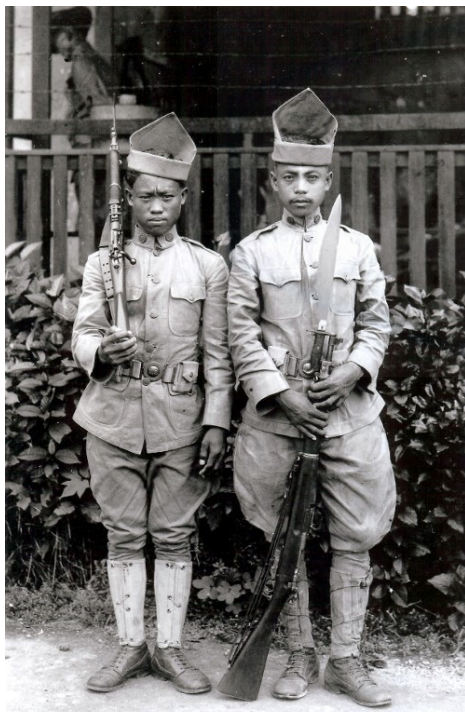
Moro Constabulary ca 1907

By May of 1902, Pershing assumed control of all Moro affairs, in large part due to his success in winning over Moro villages without resorting to violence. New orders from Davis