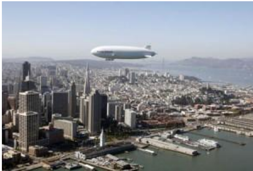
Figure 10: Zeppelin flying over San Francisco, CA 52

As the data indicates, the cost for operating LTA platforms can be lower than some traditional aircraft. Coupled with their greater endurance, LTA platforms are more cost effective to operate for some missions, compared to traditional aircraft.