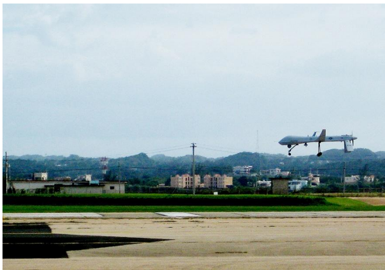
Figure 4: An RQ-1 Predator landing in Puerto Rico, following a mission supporting Operations UNIFIED RESPONSE in Haiti 23