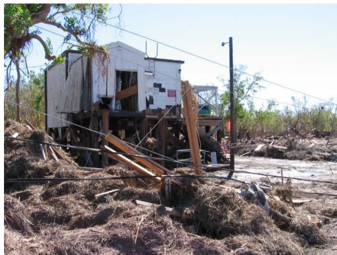
Figure 1: Delacroix, LA Telephone Switching Facility destroyed by Hurricane Katrina 5

the September 11 attack in New York City. In the chaos of the first hours following the attack, first responders immediately rushed to the World Trade Center to begin rescuing survivors. Unfortunately, their radio networks were not operating properly, leaving some isolated. After the South Tower collapsed, an evacuation of firefighters in the North Tower was ordered, but it is unclear if all of the firefighters received the message. In a 2005 New York Times article, it was stated, “Some firefighters described receiving a radio message to evacuate; others used strong language to characterize the communications gear as useless.” 4