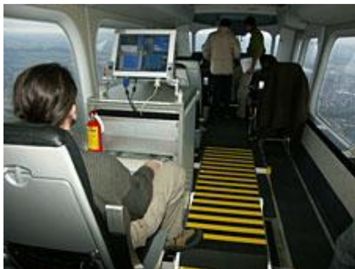
Figure 5: Zeppelin NT on an urban surveillance mission 27