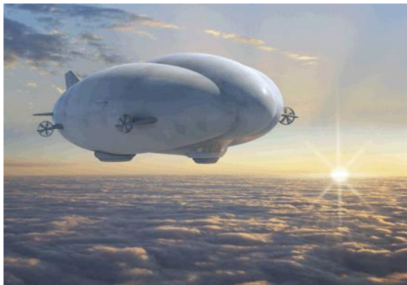
Figure 9: Lockheed-Martin Artist's Conception of hybrid airship 48

The US Army has taken an interest in advanced LTA aircraft, as well. In January 2010, the service's Space and Missile Defense Command issued a request for proposals for the LEMV contract. 49 The Army requires the LEMV to be optionally manned, fly for up to three weeks, carry multiple intelligence payloads weighing up to 2,500 lbs, provide 16kW power and reach speeds up to 80 knots. 50 The LEMV is a hybrid airship, meaning it combines buoyant, aerodynamic and propulsive lift to enhance performance and make it easier to launch and recover. Once demonstrated and proven, this hybrid airship technology can have applications in domestic disaster response operations.