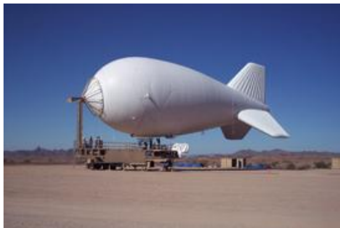
Figure 6: Lockheed-Martin's PTDS 32