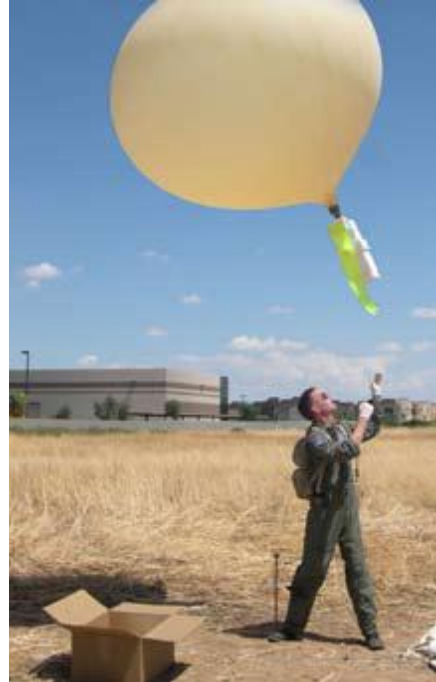
Figure 7: Launch of a StarFighter communications relay balloon 39