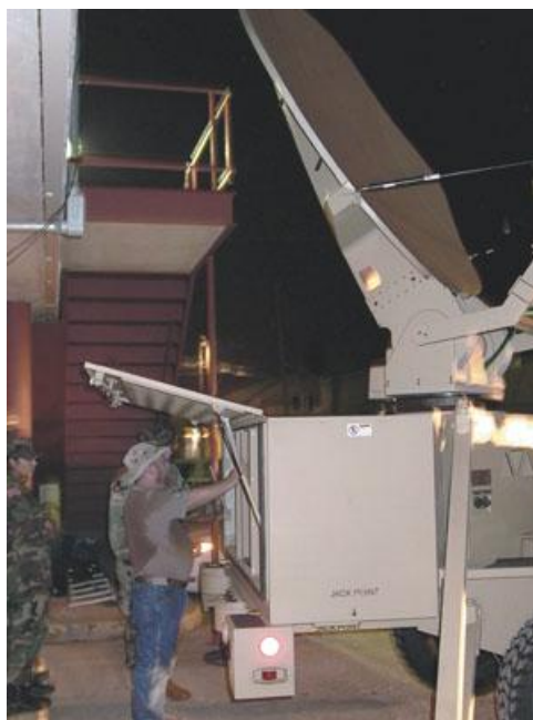
Figure 2: US Army Satellite Terminal at Louis Armstrong Int'l Airport supporting Katrina relief operations 11