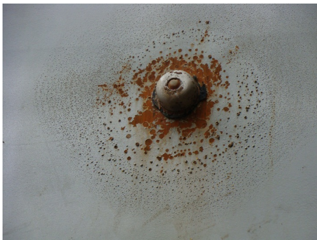
Figure 3. Example of failure from CP overvoltage. Sacrificial anode caused blistering of coating.

Many other types of coatings failure and examples of each can be found in Part 2 of this Technical Note series.