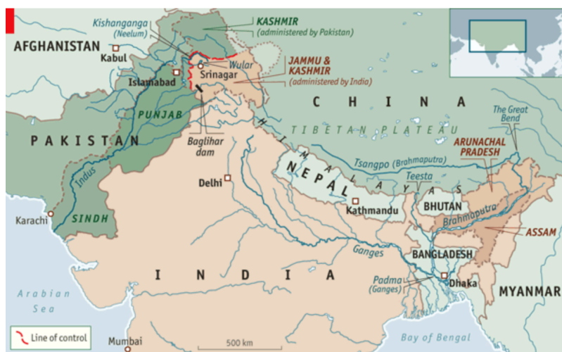
Map 3. China-India Border with Arunachal Pradesh Outlined 44

As stated, China does not recognize the Simla Accord, and claims the entire Arunachal Pradesh. This disputed area is not only the site of a territorial dispute between China and India, it is also the scene of a Chinese invasion. In 1959, just nine years after the Chinese occupied Tibet, a revolt broke out by Tibetans against Chinese rule. It was put down, and the Dalai Lama fled to India in March 1959, where he was given refuge. This angered the CCP leadership. A war of words escalated, and by that autumn, sporadic clashes erupted between Indian and Chinese troops along the border. In October 1962, the PRC launched a major invasion of both the western and eastern sector of their contested borders with India. In the west, where the fighting occurred in the Kashmir region, the Indians resisted stoutly, but in the east Chinese