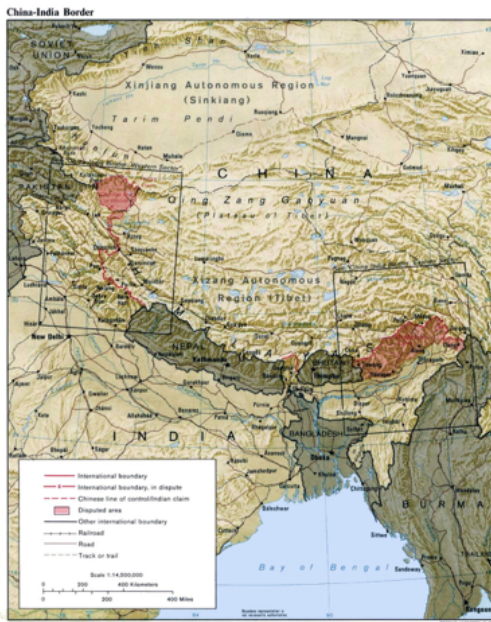
Map 2. China-India Border 43

In this manner, the Arunachal territorial dispute became linked to a core issue for China—its claim of sovereignty over Tibet. Once China invaded and occupied Tibet in 1950, both the Johnson Line and the McMahon Line became contested borders between India and China. Map 2 shows both the Johnson and McMahon Lines in red on either side of Nepal, and Map 3 indicates the Arunachal Pradesh territory.