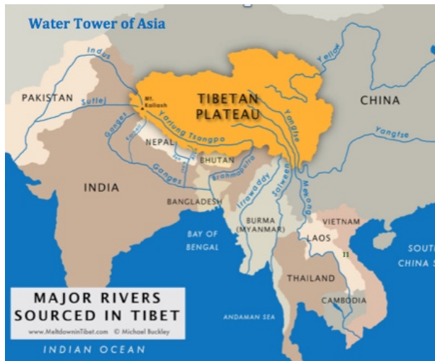
Map 1. “Major Rivers Sourced in Tibet.” 7

However, the Water Tower of Asia has sprung a massive leak. Over the next 20 years, the Himalayan region will lose 275 billion cubic meters (BCM) of annual renewable water due to the effects of climate change, while concurrently, the demand for water will continue to increase due to population growth and economic development in China, India, and other states in the region. 8