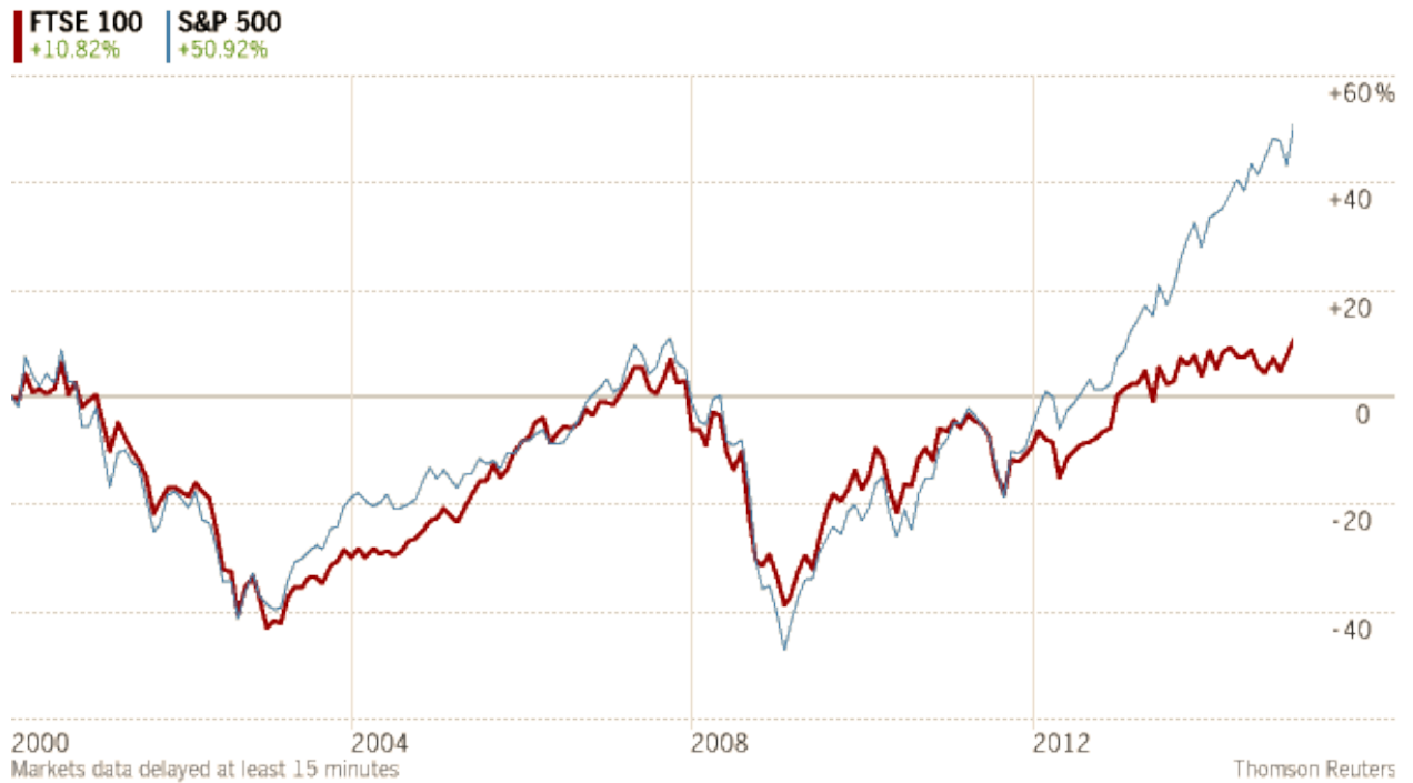
Figure 3. A Comparison of U.S. and UK Financial Markets 12

Britain invests more in the U.S. than any other country. In 2012 the American British Trade and Investment annual guidebook reported that: