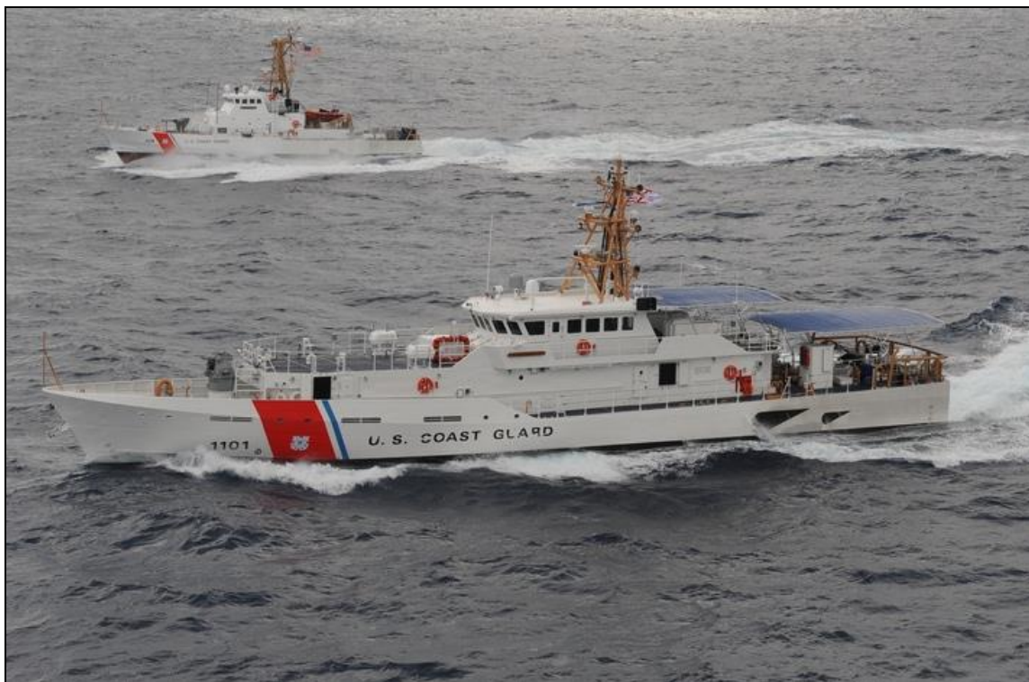
Figure 4. Fast Response Cutter (With an older Island-class patrol boat behind)