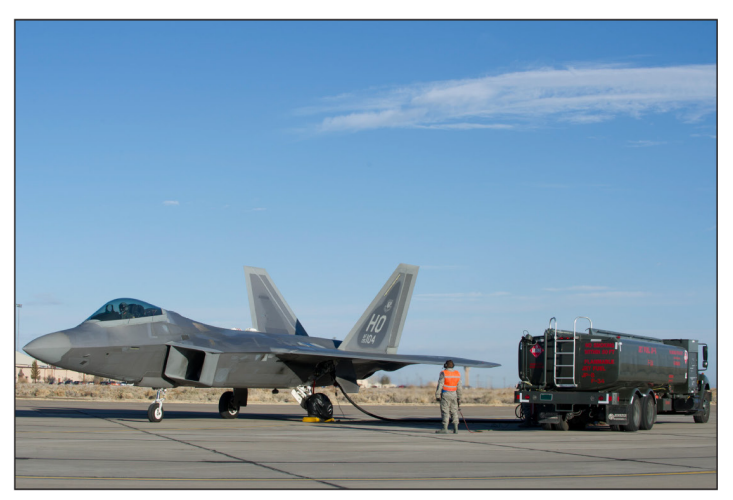
Figure 3: F-22 Aircraft Conducting a "Hot Pit" Refueling and an F-15C Aircraft Conducting an Aerial Refueling