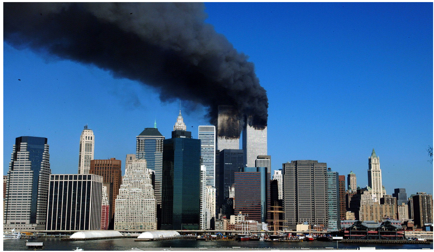
The twin towers of the World Trade Center in New York City on September 11, 2001

tourist spots, supermarkets, nightclubs, music concerts, sports arenas, shopping malls, sidewalk promenades, churches, and other public places—makes the point that no one is safe. The random quality of the violence means that risk is everywhere.