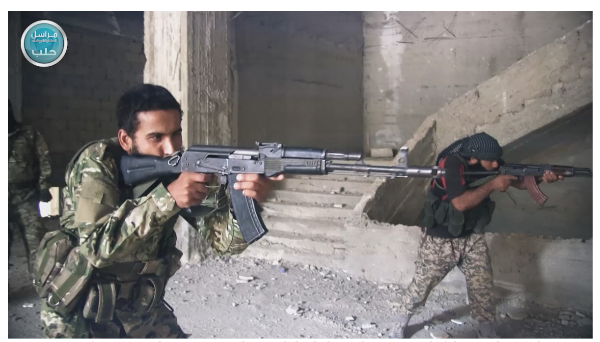
Screen capture from an October 27, 2015, video entitled "Al-Sham, the Graveyard of the Invaders" ("Al-Manara al-Bayda': Aleppo's Reporter," Jabhat al-Nusra)

from al-Qa`ida. Many of these leaders crossed frequently between Turkey and northern Syria, conducting intensive shuttle diplomacy and consultation while using the safety of Turkish territory during pauses in the talks.<sup>9</sup>