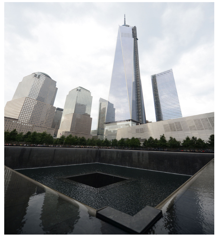
The National September 11 Memorial and One World Trade Center in New York City

Neither al-Qa`ida nor the Islamic State has become a mass movement, although both organizations attract sympathy in Muslim countries. The vast majority of Muslims polled over the years express negative views of jihadist organizations, but a significant minority expresses favorable views of al-Qa`ida and, more recently, of the Islamic State. While Usama bin Ladin's reputation declined in some Arab countries, 2013 polling found 13 percent of Muslims polled in Arab, African, and Asian countries still held favorable attitudes of al-Qa`ida.<sup>4</sup> The declaration of a caliphate by the Islamic State in 2014 created excitement among extremists worldwide and injected new life into some moribund groups. According to polling in 2015, from zero to 14 percent of the people in the countries polled had a favorable view of the Islamic State, with Lebanon (a Shi`a-majority country) at zero and Nigeria at 14 percent.<sup>5</sup> Although the percentage of favorable ratings for the terrorists is