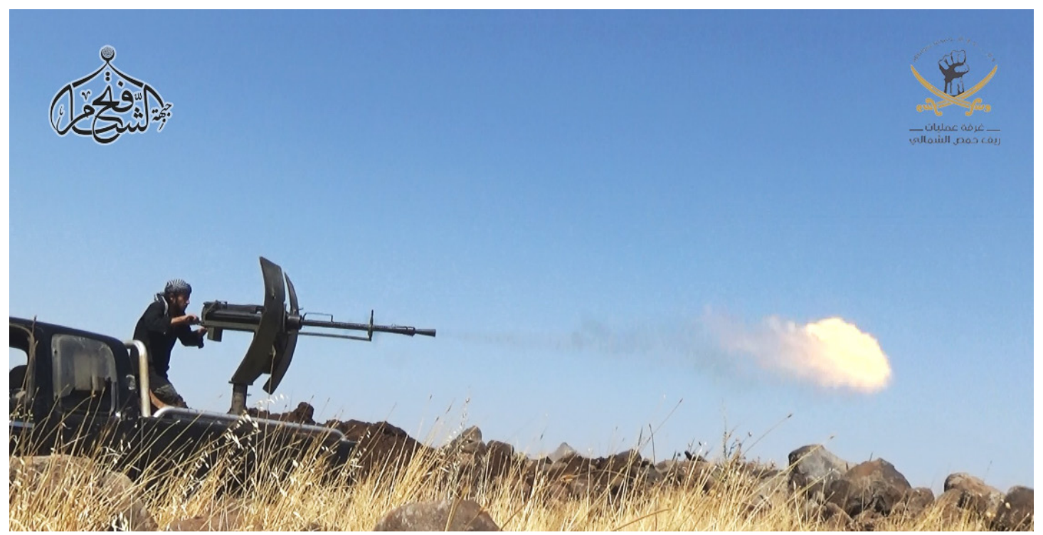
Photo from Jabhat Fateh al-Sham's official Twitter and Telegram accounts purportedly depicting its battle against the Syrian Army on August 23, 2016, on the outskirts of al-Zara village on Homs' northern suburbs (Jabhat Fateh al-Sham)

Notwithstanding JFS' continued focus on the long-game and localism, some level of intensified international military action against the group also seems highly likely, given declarations made publicly by both the United States and Russia. That in and of itself will make it all the more likely that JFS will aim to draw more of the mainstream opposition further into its operational orbit to prevent external pressure from successfully decoupling opposition groups from working with it. Intensified efforts will doubtlessly also be invested by JFS to secure the formal subsuming of friendly jihadist groups already under the al-Qa`ida umbrella. Moreover, interna-