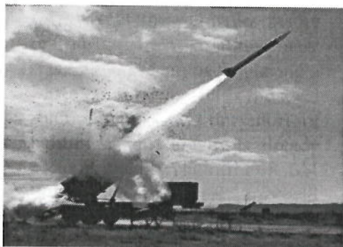
Patriot or PAC 3 Launch

Long-range systems are limited by the same factors that make the ICBM vulnerable. There is a very limited window during which the GMD or THAAD must be launched in order to intercept the missile at the apex of its trajectory since both missiles must fight gravity on their way out of the atmosphere. If the first attempt to shoot down an incoming missile fails, then there will not be another opportunity to destroy the target before reentry into the atmosphere. After this point, the destruction of the target becomes not only more difficult but more risky. Gravity is now accelerating the missile while it slows the interceptors and destroying a ballistic missile in the atmosphere runs the risk of scattering whatever payload it might be carrying. This is especially hazardous in the case of biological and chemical weapons, where destruction of the target risks aerosolizing