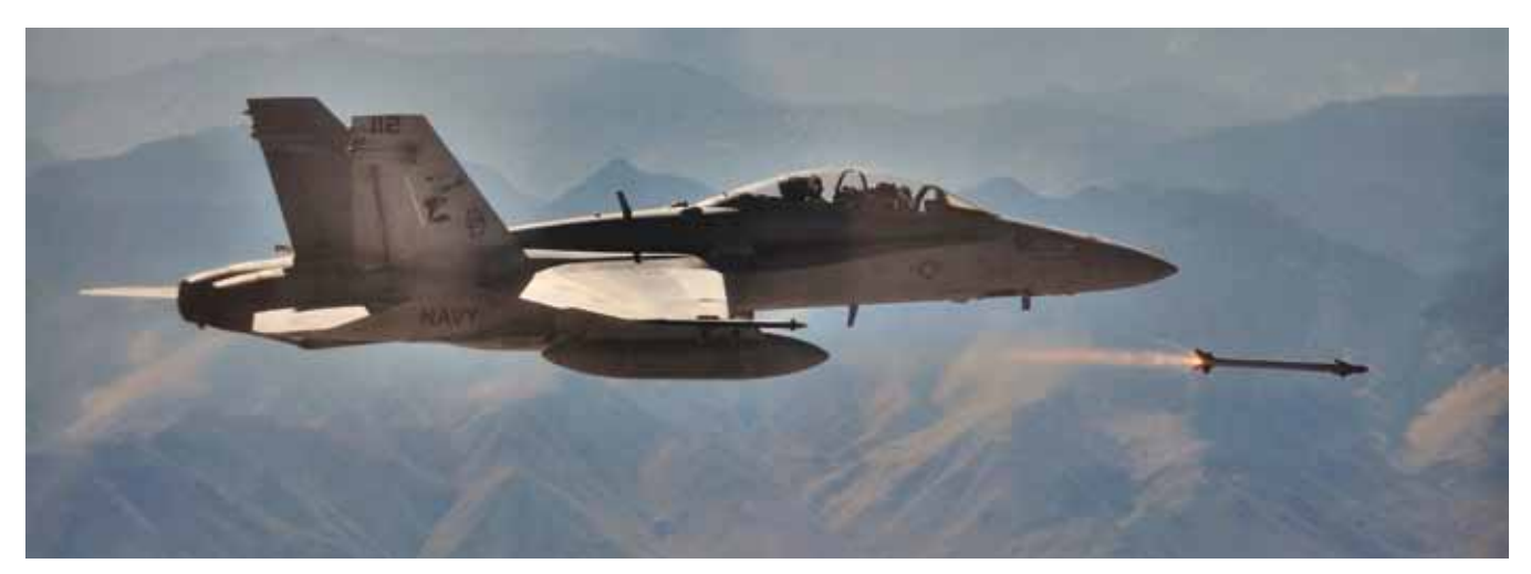
The AIM-9X Sidewinder Air-to-Air Missile program was an early adopter of should-cost management.