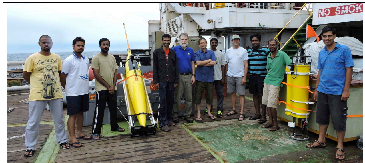
Fig. 2. Lagrangian float and Seaglider on the Sagar Nidhi before deployment.