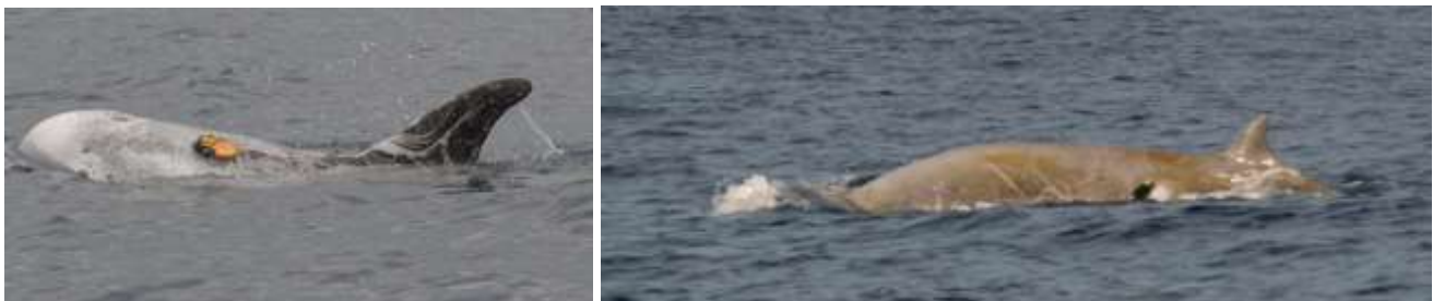
Figure 2. Left: Risso's dolphin with Dtag (v3). Right: Cuvier's beaked whale with Dtag (v3). Both individuals were tagged at the Azores during the Azores-Baseline 2015 Project, under permit number SAI/DRA/2015/1267 (issued by Secretaria Regional da Agricultura e Ambiente, Portugal).

In addition, we collected tag data from 3 deployments on Cuvier's beaked whale ( Ziphius cavirostris ), including one simultaneous deployment of 2 tags on two individuals in one group, and one 24.7-h deployment (Table 1). These deployments have resulted in high quality off-range datasets (long records, high quality movement and acoustic data across behavioral contexts, limited/no acoustic disturbance), and first records to be collected in the North Atlantic. Beaked whales, and particularly the Cuvier's beaked whale, are among the species that are most sensitive to naval sonar. Information on their natural behavior is essential to improve our understanding of their response. This is hard to obtain however, given their cryptic lifestyle and difficulty to approach for tagging. The 3 tag datasets obtained in 2015 are the first records of the diving, foraging and acoustic behavior of this species at the Azores. They showed foraging depths and acoustics consistent with those found in other areas, and the double tag record revealed coordination in the diving behavior of the two tagged whales. The tag records are currently being analyzed in detail for cross-area and cross-species comparison of beaked whale behavior.