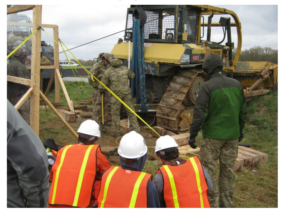
Fig. 10 Team AFRL at Auburn Air Force Base in Tennessee, April 2014. The air bag is in the background underneath the bulldozer.

The team had some difficulty designing and implementing an inner liner for their otherwise strong multilayer Kevlar<sup>TM</sup> bag system. They learned the hard way that the rubber inner deserves as much attention as the strength layers. Their bag was able to lift the back end of the bulldozer by about an inch, but then