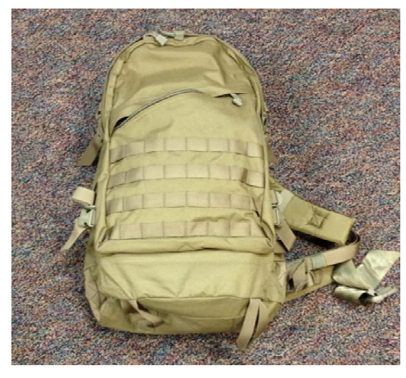
Fig. 3 Rucksack containing all the components showed in Fig. 2, total weight 13.2lbs. The typical usage sequence is shown in the following figures.