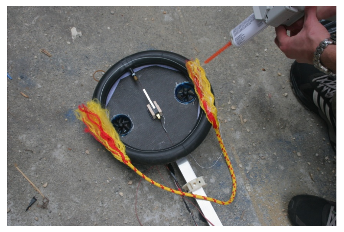
Fig. 4 Showing epoxy application to the frayed rope attachment on the vacuum cup.