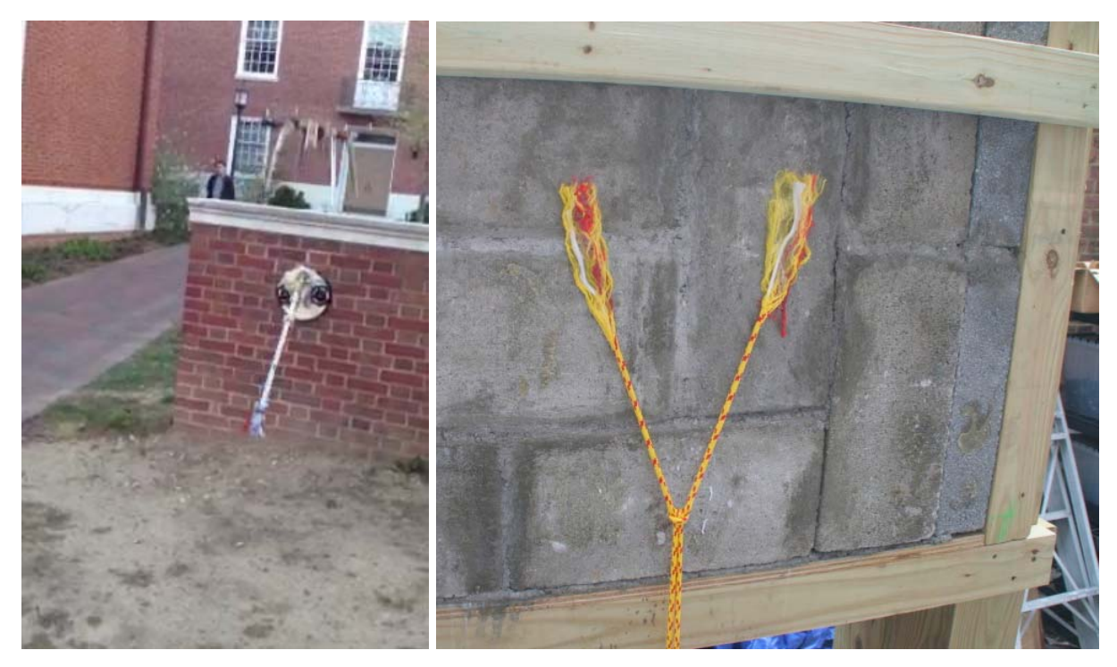
Fig. 6 Left: the vacuum cup and its boom detach from the quadcopter and remain attached to the wall by suction from two ducted fans in the assembly. The epoxy adhesive cured within about 5 minutes. Right: the frayed rope bonded to a test wall.

At the competition in Dayton, OH, in April 2012, team SCALE flew their quadcopter to a height of about 50', carrying the vacuum cup and uncured epoxy. The quadcopter began to behave erratically and crashed. It was later found that one of the propellers had been insufficiently tightened.