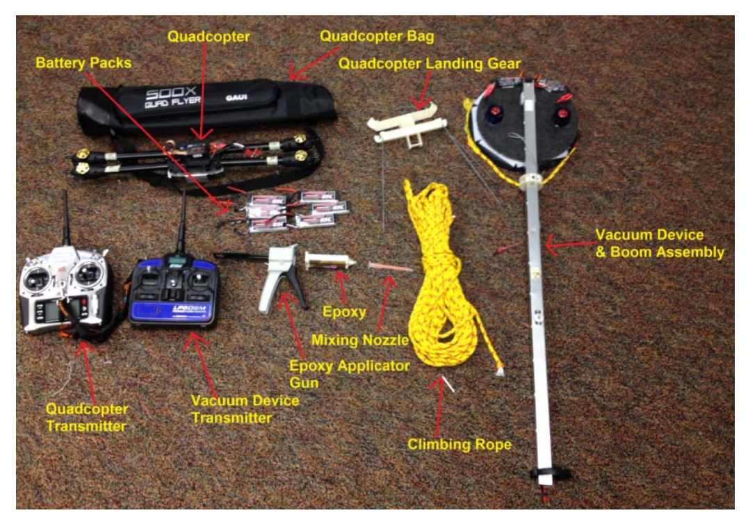
Fig. 2 All parts of SCALE system unloaded from the rucksack.