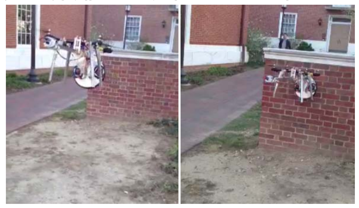
Fig. 5 The quadcopter, carrying the vacuum cup, is then flown to the attachment site and presses the vacuum cup to the wall.