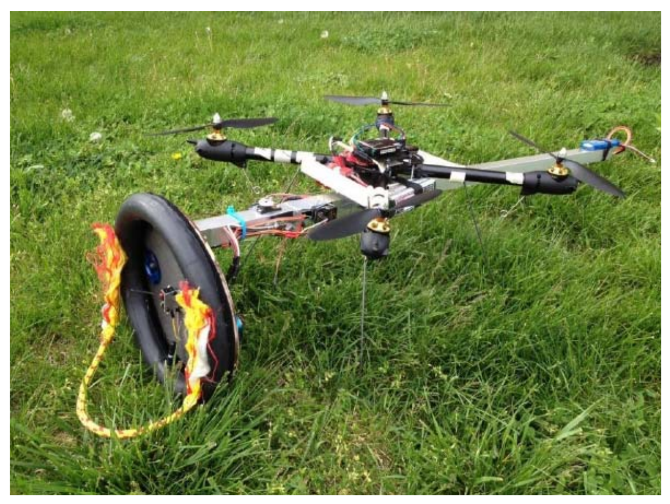
Fig. 1 Team SCALE 2011-12 quadcopter with attached vacuum cup.