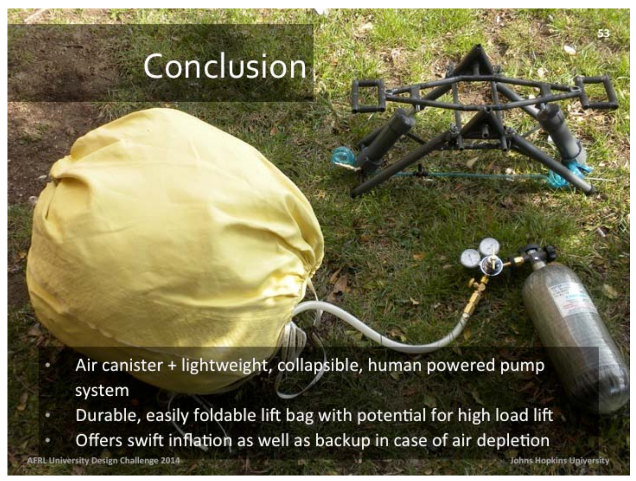
Fig. 10 Team AFRL air bag, custom pump and commercial SCUBA cylinder.

The challenge was to lift a heavy vehicle that had fallen over in mud or on a gravel slope, using equipment that would be light enough for a pararescue jumper to carry.