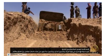
ISIS breaks through the Iraq-Syria border as symbolic of breaking the Sykes-Picot agreement

So how did a group like ISIS emerge in the first place? It goes back much further than the U.S. invasion of Iraq in 2003. In 1916 France and Britain entered an agreement, known as the Sykes-Picot agreement, which divided the Arab provinces of the Ottoman Empire into British and French territories. 24 Provinces of Mosul, Baghdad, and Basra, once separated by ethnicity, were grouped into the new state of Iraq, a word that ironically means “well-rooted country.” 25 The consequences are apparent today. Many Arabs view the Sykes-Picot agreement as the beginning of a sequence of betrayals by the West. 26