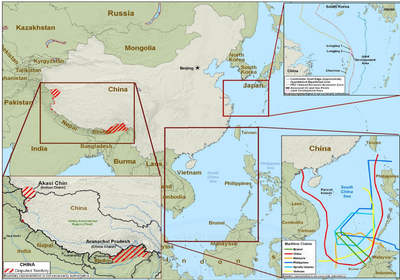
Figure A.4. China's Disputed Territories. (Reprinted from The University of Texas Libraries, http://www.lib.utexas.edu/maps/middle_east_and_asia/china_disputed_territories_2009.jpg ). "While not exhaustive, three of China's major ongoing territorial disputes are based on claims along its shared border with India and Bhutan, the South China Sea, and with Japan in the East China Sea."