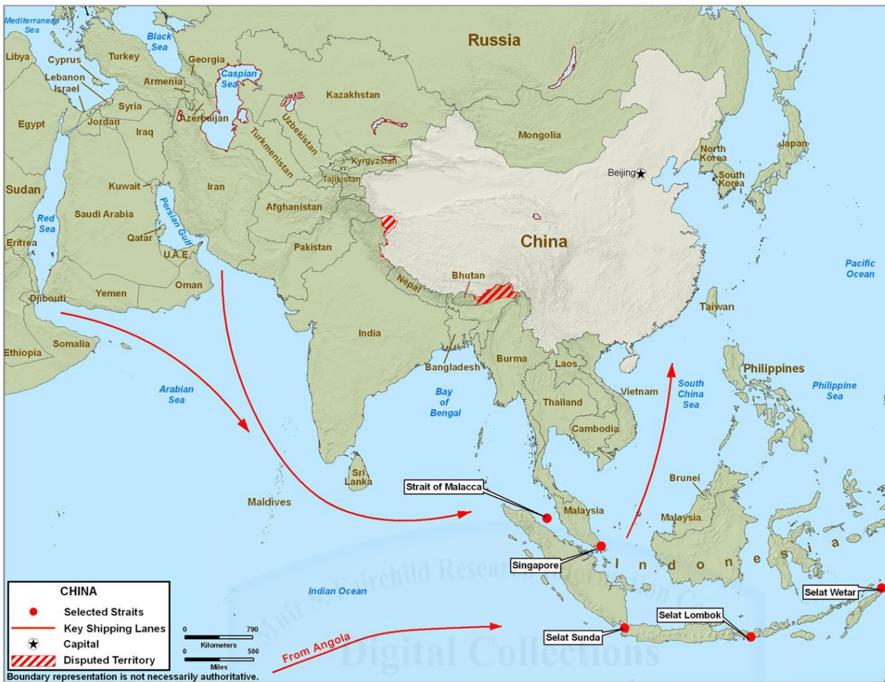
Figure A.6. China's Critical Sea Lanes. (Reprinted from The University of Texas Libraries, http://www.lib.utexas.edu/maps/middle_east_and_asia/china_critical_sea_lanes_2009.jpg ).