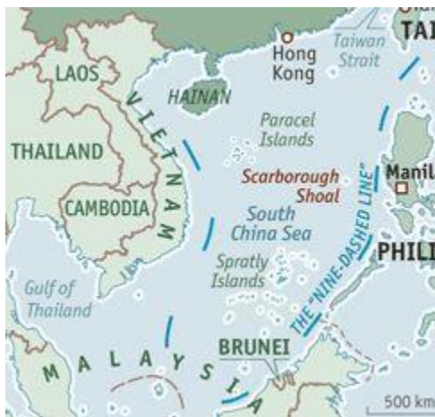
Figure A.5. Nine-dashed line. (Reprinted from The Economist, http://www.economist.com/blogs/banyan/2014/05/china-v-vietnam ).