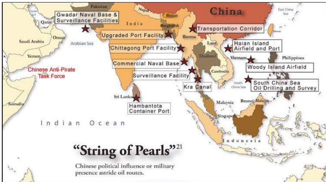
Figure A.7. China's port system to support energy access. (Reprinted from Joint Operating Environment (JOE) 2008 and included location of China's Anti-Pirate Task Force operation off the coast of Somalia http://www.eaglespeak.us/2010/06/india-and-chinas-string-of-pearls-sea.html ).