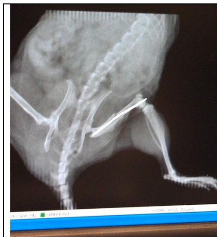
Figure 3: Successful generation of a unilateral mid-shaft fracture on the pinned femur using the device.