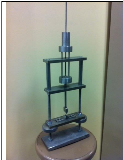
Figure 1: Device that utilizes a 3-point bending strategy to perform closed fractures in mice was assembled.

The mice were divided into two groups of 5. From the day following surgery, one cohort received tri-weekly injections of sterile saline (200 \mu l/mouse) for 6 weeks, while the other cohort received tri-weekly injections of STO-609 (10 \mu moles/kg body weight; 200 \mu l/mouse) for 6 weeks. At the end of the 6-week period, mice were euthanized and fractured and contralateral control femurs were isolated and dissected clean of all soft tissues. The bones were then wrapped in saline soaked gauze or placed in 10 % formalin. Later the femurs were scanned using micro-CT at 7 micron voxel size for volumetric analysis of the healing fracture callus. We are currently performing the 3D volumetric analyses to calculate total volume of callus, along with BV/TV, maximum area and polar moment of inertia. After completion of these analyses, we will perform the dose response curve analyses of STO-609 to determine the optimal conditions of CaMKK2 inhibition that will confer the most efficacious recovery from bone fracture.