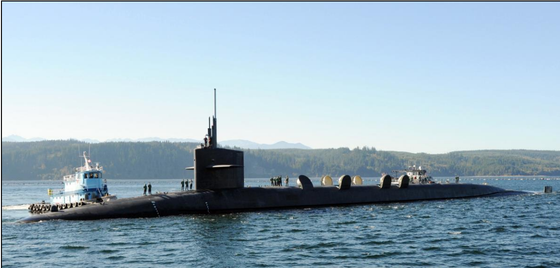
Figure I. Ohio (SSBN-726) Class SSBN With the hatches to some of its SLBM launch tubes open