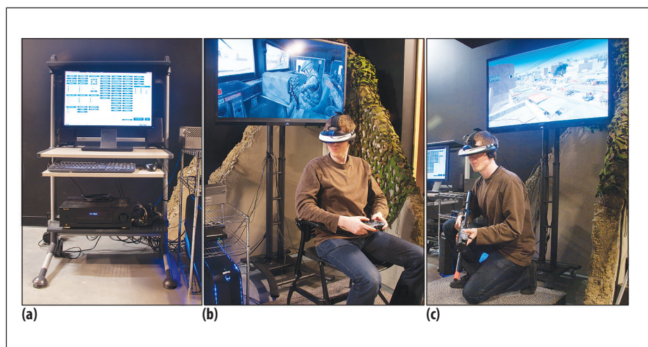
Figure 2. Sample Bravemind system components. (a) A clinician interface for modifying VR settings in real time to match user experiences. (b) VR head-mounted display and traditional gamepad used by a seated participant in a driving scenario. (c) Rifle-mounted mini-gamepad used in a walking scenario.

We consider these first two emerging applications here.