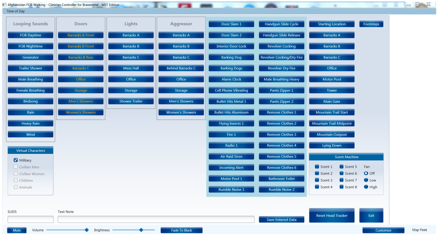
Figure 3. US Base and Town Scenario Clinician Interface.