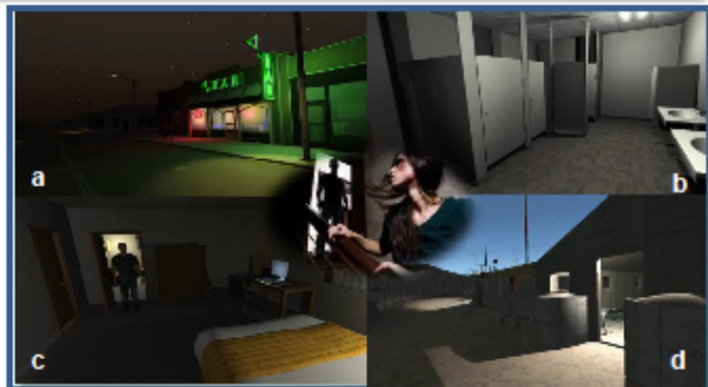
Four VR contexts for conducting Virtual Reality Exposure for PTSD due to Military Sexual Trauma: (a) Civilian Bar Town; (b) Barracks Bathroom; (c) Bedroom; (d) Forward Operating Base.

Military Sexual Trauma (MST) has been recognized as a significant risk factor for the development of PTSD. This has become an issue of grave concern within the military, as reports of sexual violations and assaults have been on the rise over the last ten years, and have garnered significant popular media attention. The current project proposes to develop content for inclusion in the BRAVEMIND virtual reality exposure therapy (VRET) system that will provide new customizable options for persons who have experienced MST and to run a pilot RCT (in collaboration with Barbara Rothbaum at Emory University) with a sample of 34 persons diagnosed with PTSD due to MST.