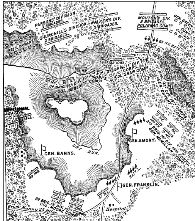
Figure 3. Battle of Pleasant Hill, 9 April 1864

J. Smith proved to be the saving-grace of the day, ordering a charge against the Confederate forces late in the day, driving a wedge between the line and bringing a close to the day's fighting, resulting in neither great victory nor decisive defeat for either side. 38 In total, the Union lost 1,065 killed, wounded, or captured. 39 Despite holding the ground, Banks ordered his troops back to Grand Ecore that night, and ultimately back to Alexandria ten days later. 40