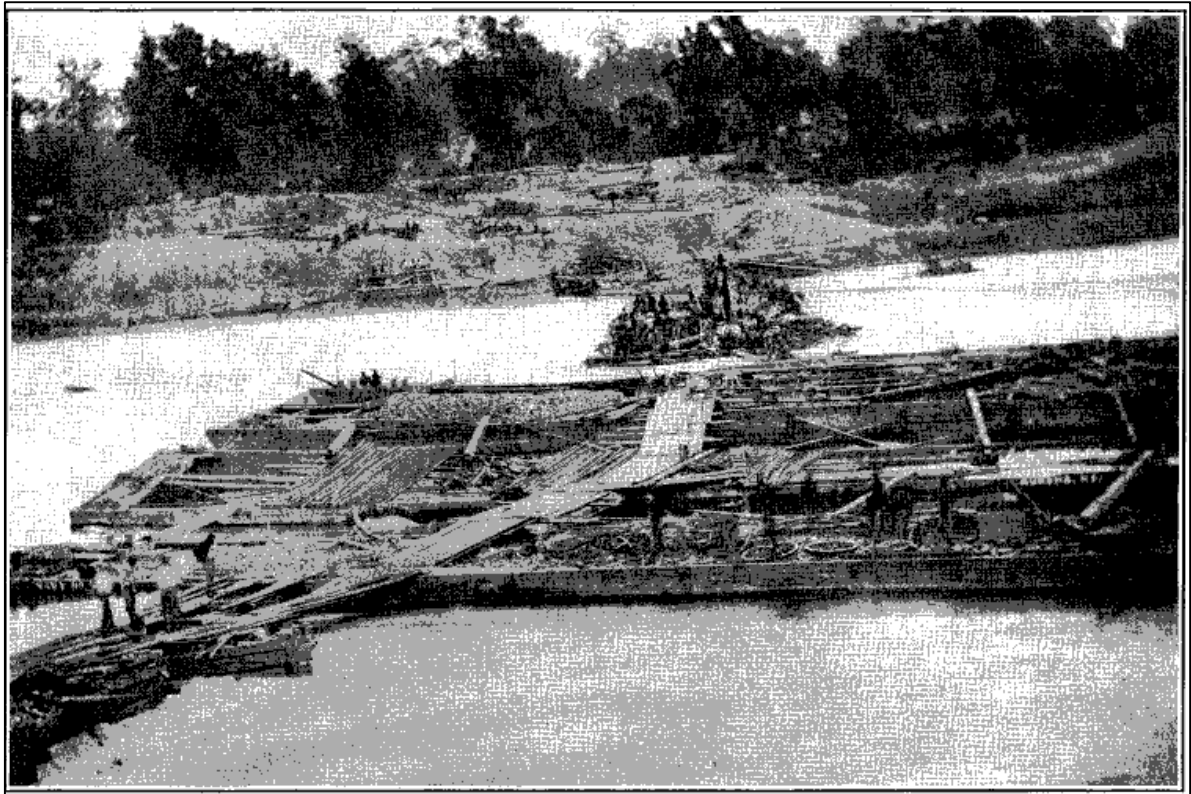
Figure 4. Bailey's Dam across the Red River

building a dam led to one of the only true Union success stories of the entire expedition, and campaign.