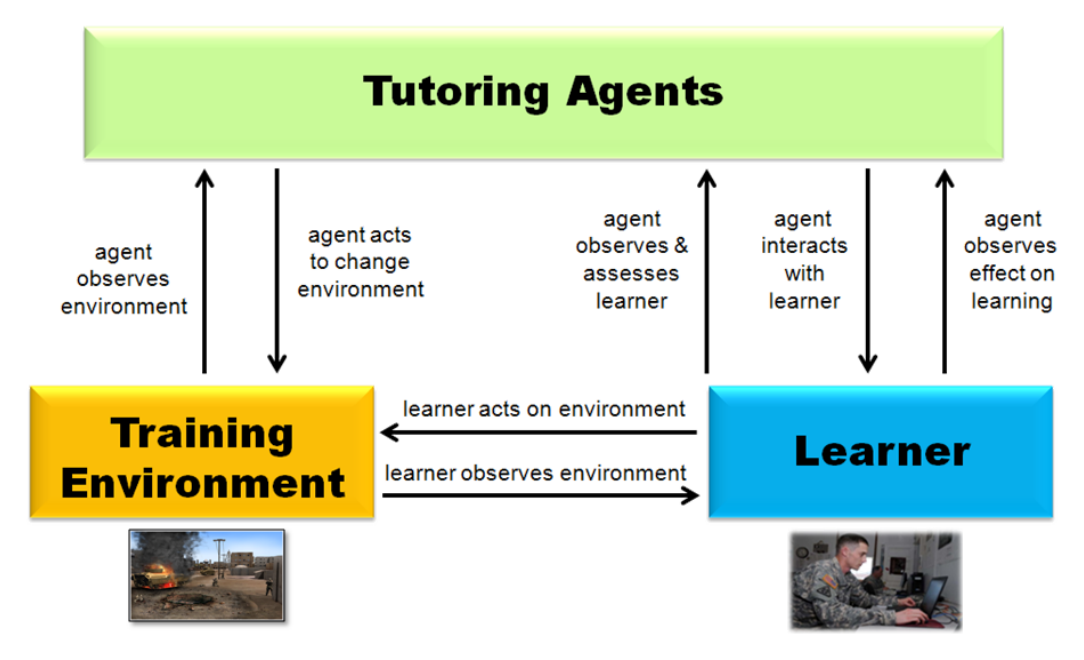
Fig. 1 Adaptive training interaction

room or stay outside) and then observes any changes or reactions within the environment. Adaptive systems add a layer of software-based tutoring agents that are designed to guide the learner in much the same way as a human tutor interacts with a learner. The tutoring agents observe the behaviors of the learner to assess their states (e.g., performance and attitudes) and interact with the learner to provide support, direction, and instruction. In addition, they track the effect of interactions on learning. Tutoring agents also interact with the training environment and may manipulate the environment to present more challenging or less challenging scenarios in response to the assessed state of the learner.