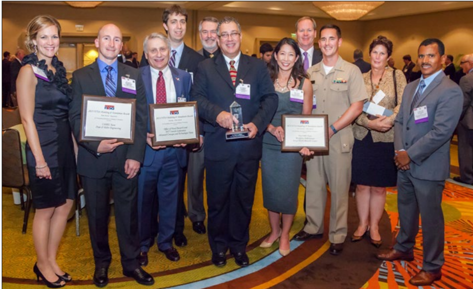
The National Training and Simulation Association presented its annual Modeling & Simulation Awards during a banquet Dec. 1, 2015, Orlando, Florida. The Naval Health Research Center's PhyCORE team was recognized in the category of "Cross-Function," for work done to expand and enhance a virtual reality walking and balance tool for injured warfighters into one that can also promote injury prevention and resilience.

Story courtesy Naval Health Research Center Public Affairs