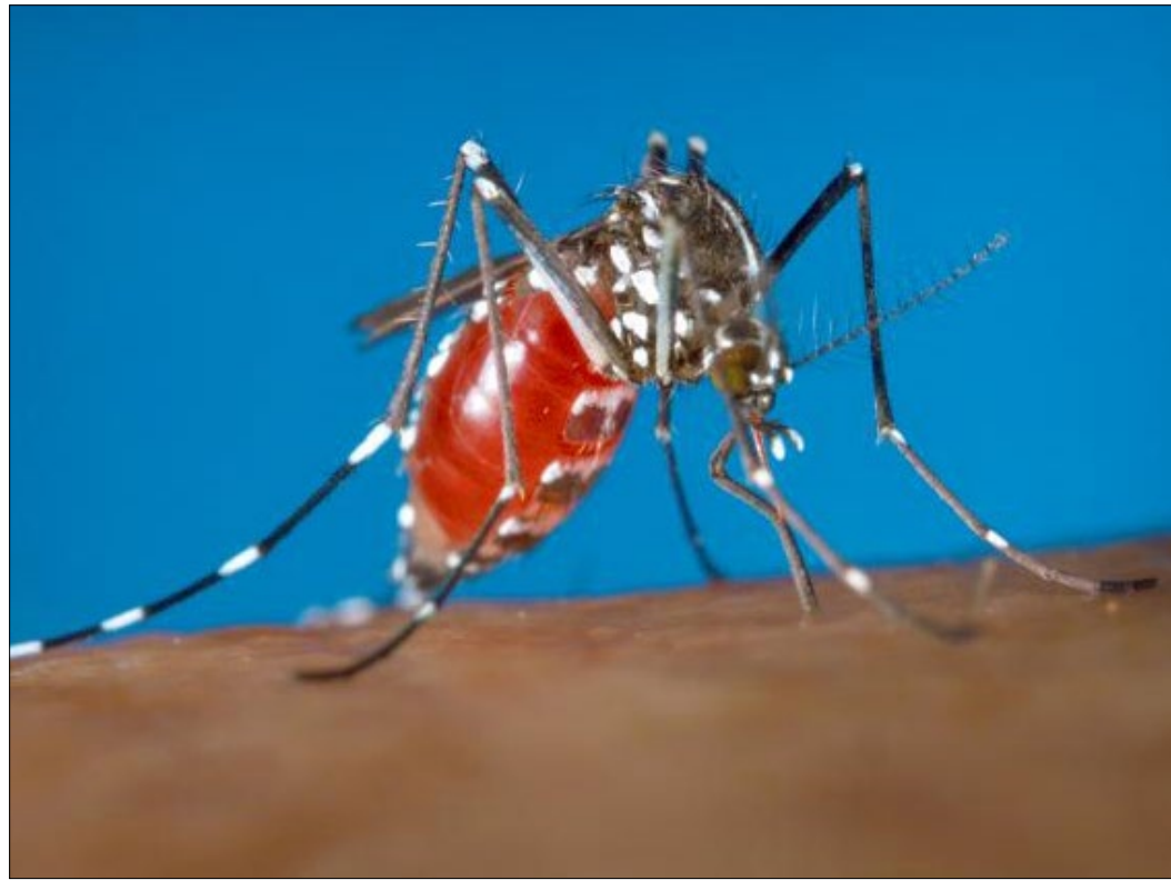
Dengue is caused by any one of four closely related viruses transmitted by the bite of an infected Aedes aegypti mosquito. About half of the world's population is now at risk.

The NMRC team is collaborating with other Navy Medicine researchers at the U.S. Naval Medical Research Unit No. 6 in Peru and the U.S. Naval Medical Research Center – Asia in Singapore