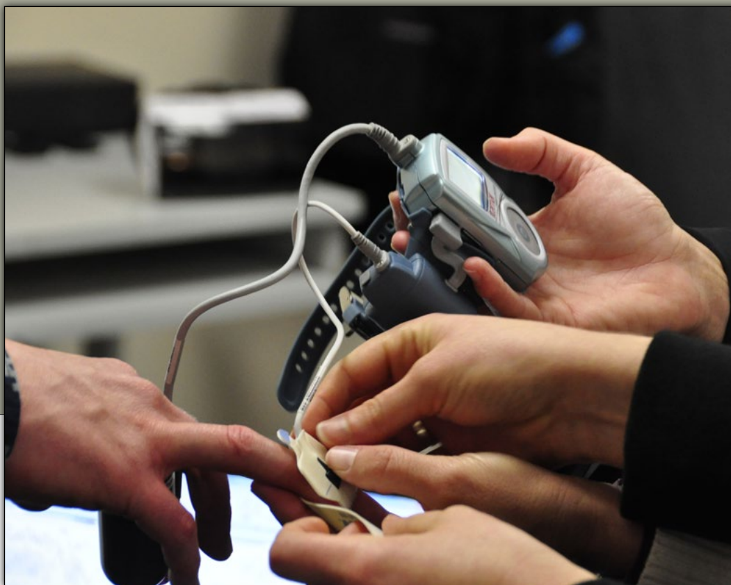
At the Naval Health Research Center (NHRC), scientists are evaluating new consumer-available technologies to determine if any of them perform well against the gold-standard methods of assessing sleep including mobile wrist actigraphy.

Overall research findings suggest that inadequate levels of sleep when sustained over time increase the risk of physiological disease (including metabolic diseases such as obesity and diabetes), may decrease testosterone levels, and lower immune system functioning, allowing greater susceptibility to illness. These are just some of the physiological effects poor sleep can have over time.