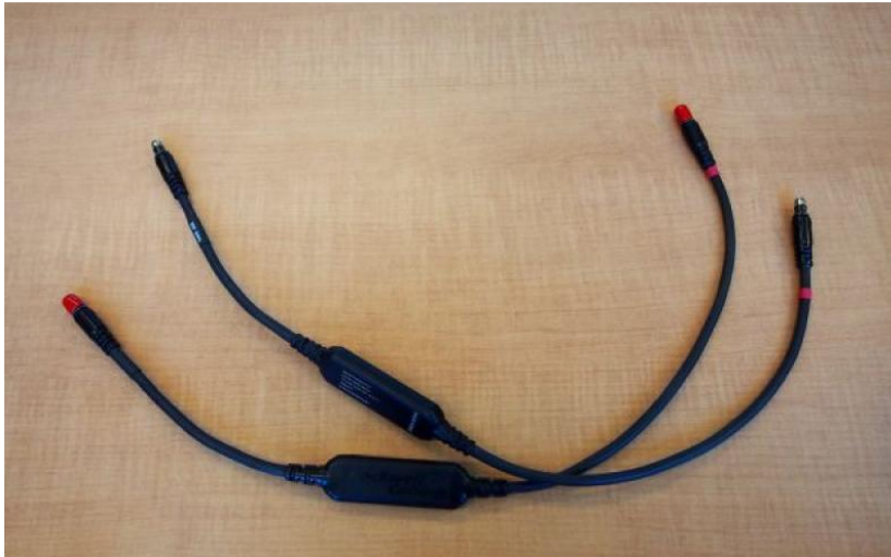
Figure 2 TACDIS cable (ref. 5)