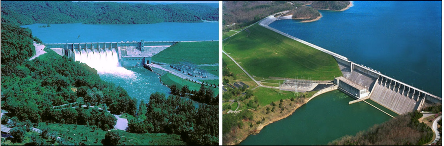
Figure 2: Center Hill, TN, (left) and Wolf Creek, KY, Dams

Source: U.S. Army Corps of Engineers. | GAO-16-106