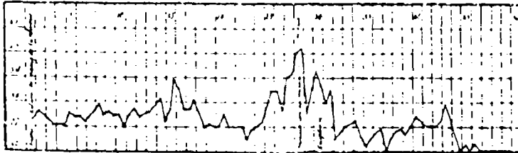
Curve II. (Chimpanzee).

(Inoculation with blood from a typhus patient