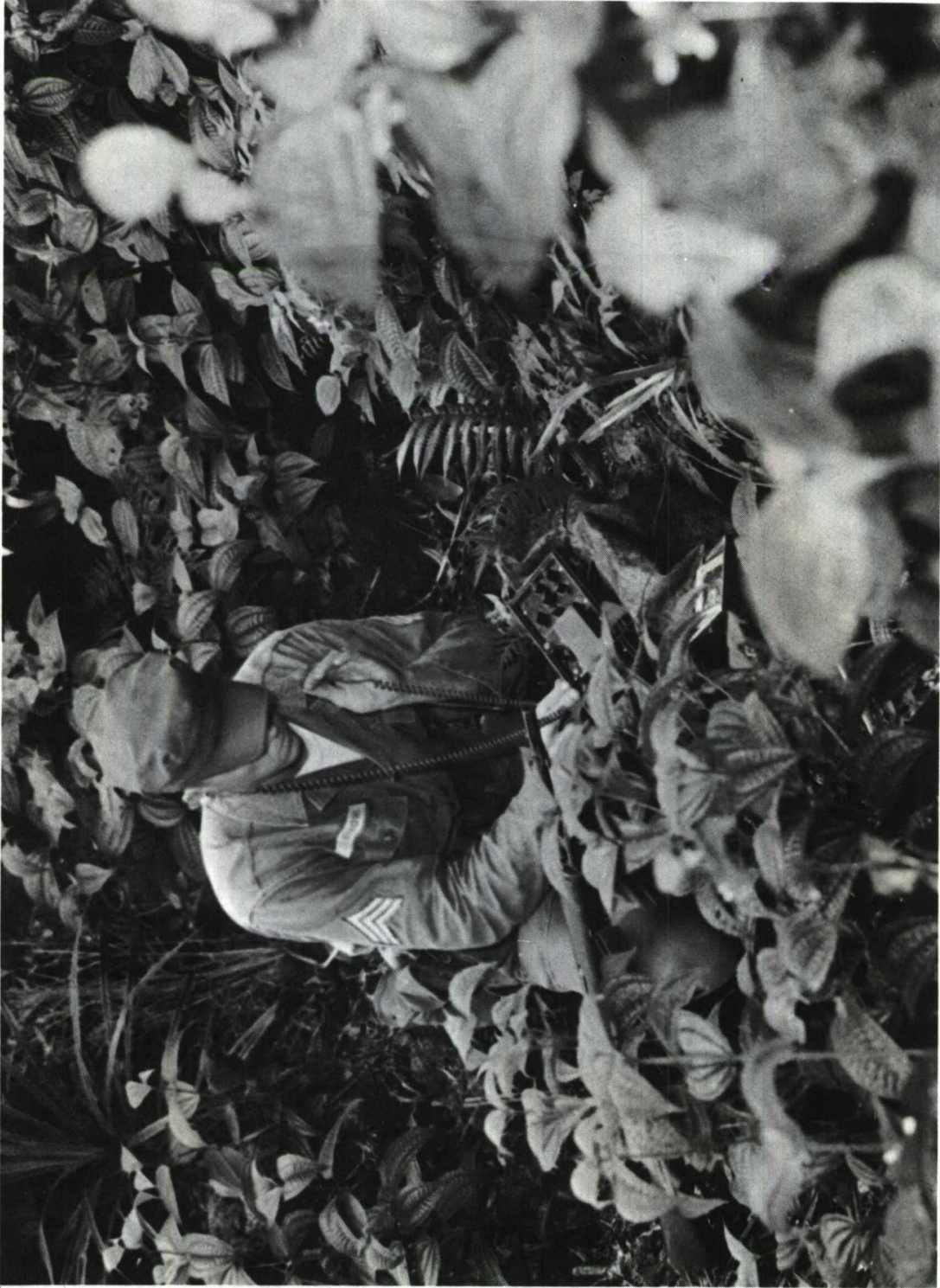
Frontispiece AN/PRC-64 Radio being used in the jungle