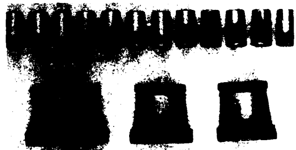
Fig. 1—Uninhibited perfluoroalkylpolyether grease (ASTM D 1743-64)

Further, recent tests (8) conducted on a 440C stainless steel R-4 bearing rotating at 3,000 rpm at 5-psi pure oxygen at 70 percent relative humidity lubricated with perfluoroalkylpolyether-polytetrafluoroethylene grease was found to be inoperable after approximately 1,000 hours