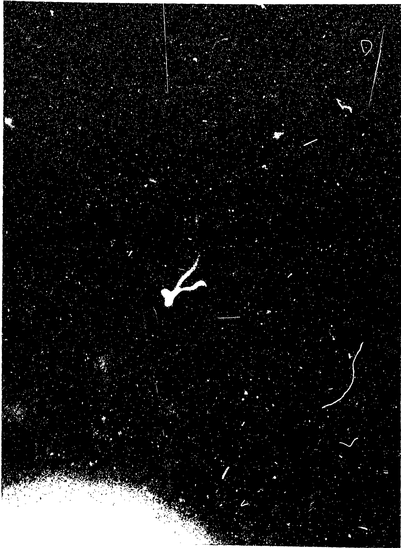
Figure 1. Photograph of the 123A sea urchin observed from later time at 1 + 2 frame.