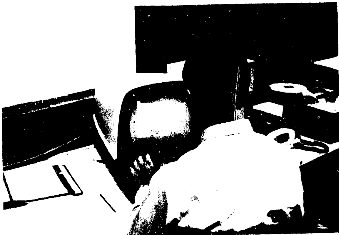
Figure 4. "Action Officer" subject completing format on CRT.