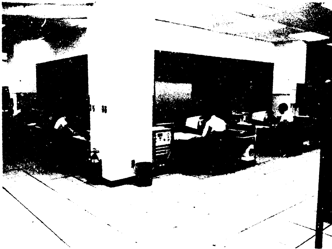
Figure 1. "Action Officer" subjects manning four of the six stations in the experiment.

IV. On-line, verified. Subjects worked in pairs. Each subject translated the message directly on the CRT screen; the two then proof-read their screens to each other and resolved any differences they detected. They then entered the consensus version into the data base.