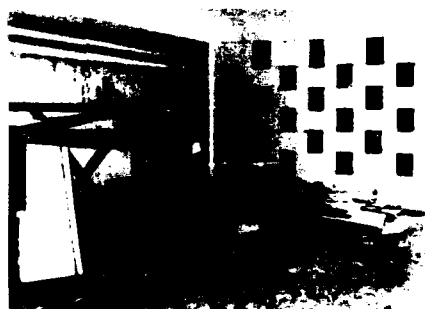
Fig. 2—Area under the officers' swimming pool, U.S. Naval Station, Sangley Point, Republic of the Philippines. The area had been cleaned up earlier, but there were still good sites for shrews to nest.

Positive isolates were made from two Taiwan shrews and two Philippine shrews. Both Taiwan isolates were identified as being indistinguishable from L. javanica while the Philippine isolates were found to be L. grippityphosa and L. bataviae . Of the 26 Taiwan sera tested, four were positive both by the macroscopic slide agglutination test and the microscopic agglutination test while two of seven Philippine sera tested were