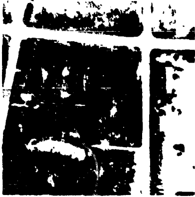
(A) \Delta scale = 1:1; \Delta orientation = 0°