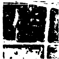
(B) \Delta scale = 2:1; \Delta orientation = 90°