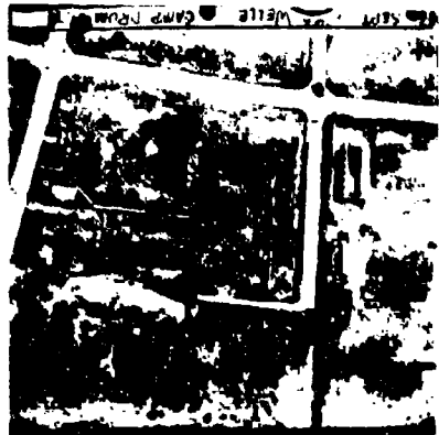
Figure 3. Illustration of comparative photo pair presented at each of the scale/orientation discrepancy levels.