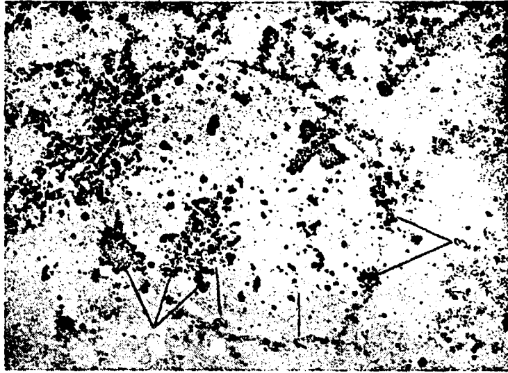
Figure 3. An electron microscopic micrograph of a section of the cutaneo-muscular tissue of human embryo infected by the FPV virus and incubated in the presence of the C^{14} -adenine 30 min. after infection. 1- nucleus; 2-, nucleolus; 3- autographs x 12000 magnif.