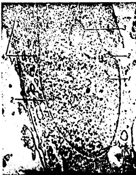
Figure 1. Electron micrograph of a section of uninfected cell of cutaneo-muscular tissue of human embryo.

1 - nucleus, 2 - nuclear membrane; 3 - nucleolus; 4 - mitochondrion. X 12000 magnif.