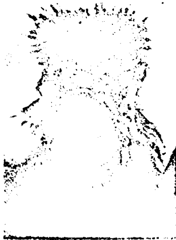
Photograph not reproducible

A horse with a positive ophthalmoprobe and complement fixation test. Strain No. 22265 used for the preparation of mallein was obtained from this horse.