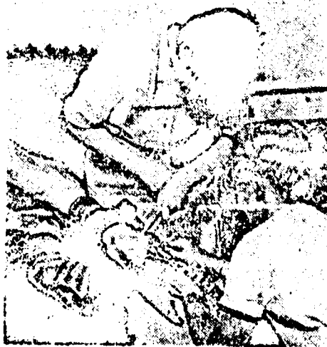
Photograph not reproducible