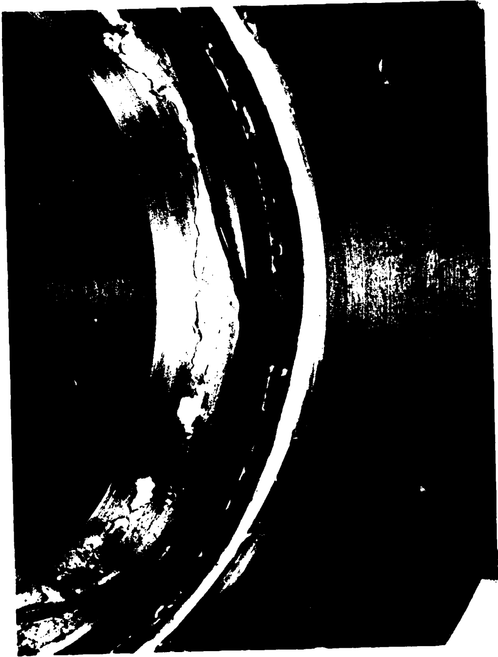
Figure 1. Lip seal damage after 20 cycles. Angular flange seal with rectangular groove.