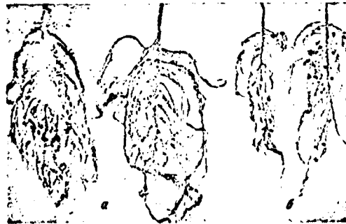
Figure 2. Root system of one-year-old seedlings of the black locust. a--watered with root secretions of the summer oak; b--control (water sprinkled)