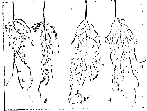
Figure 3. Root system of one-year-old seedlings of the black locust. a--watered with root secretions of the little-leaf elm; b--control (water sprinkled)

Consequently, root secretions of the elm, locust, pear, apricot and oak stimulate the sprouting of seeds and growth of shoots of the oak during the first days but then have an inhibitory effect.