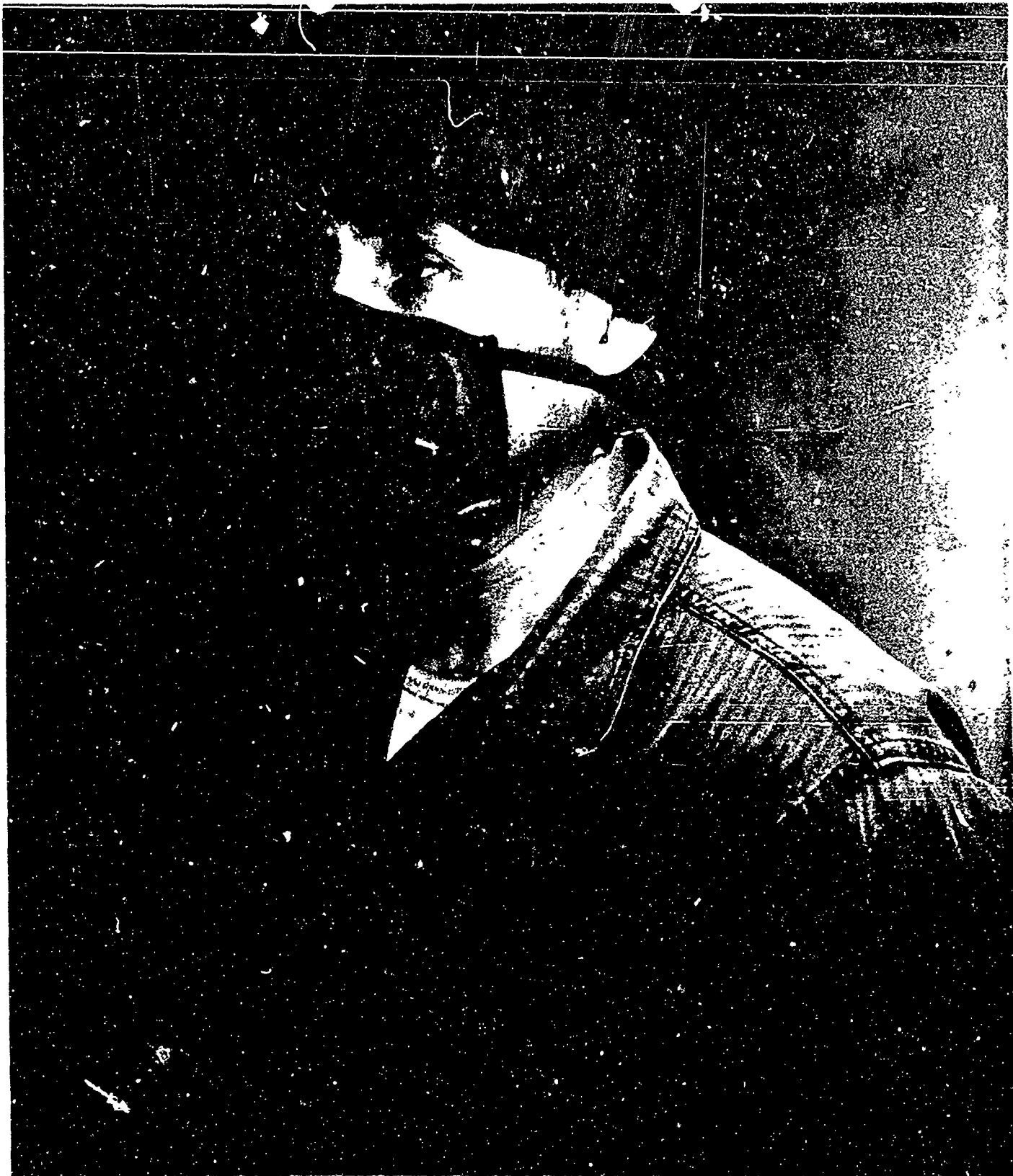
Fig. 1 Expendable Dust Respirator, E5 ARMORED MEDICAL RESEARCH LABORATORY FORT SNOD, KY. Project No. T-3 12/18/44