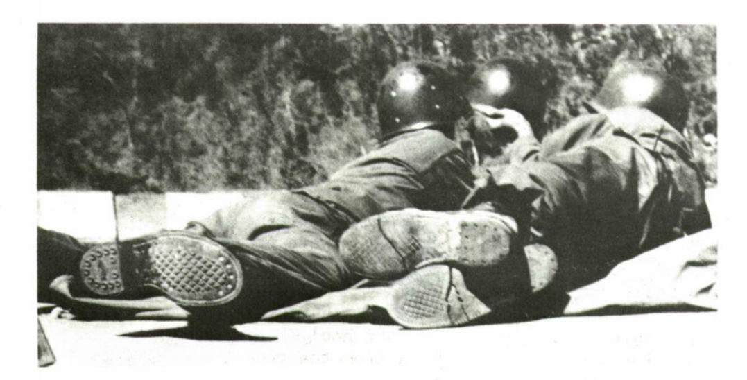
Crack across ball of outsole

A visit was made to Camp Narai, Lopburi on 1--2 April. This airborne training company had approximately 3000 troops and over