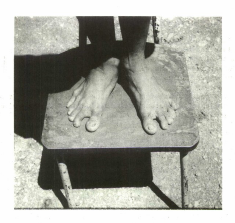
Thong Space Between 1st and 2nd Toe

It should be noted that the test subjects considered it an honor to participate in the test. Accordingly, it became necessary to check the feet carefully to avoid including test subjects who actually were not well fitted but who wanted to participate in the test, or when "borderline" cases of fit were included in the test; this was done deliberately to insure check of the adequacy of the last where the fit was barely adequate.