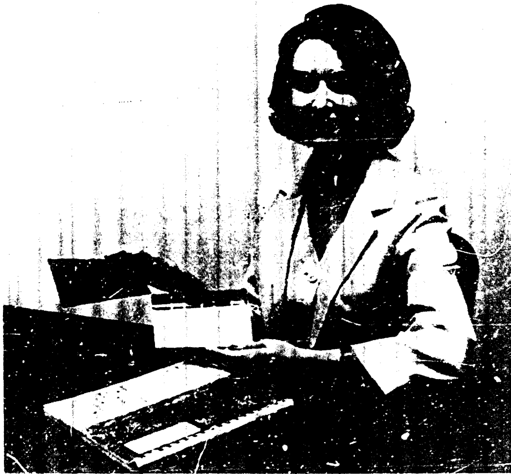
Using microfiche, a 100-page printed report can be placed on two 4-in. x 6-in. cards.