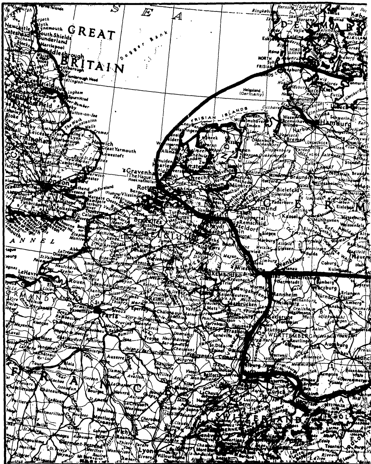
FIGURE 1. Pr