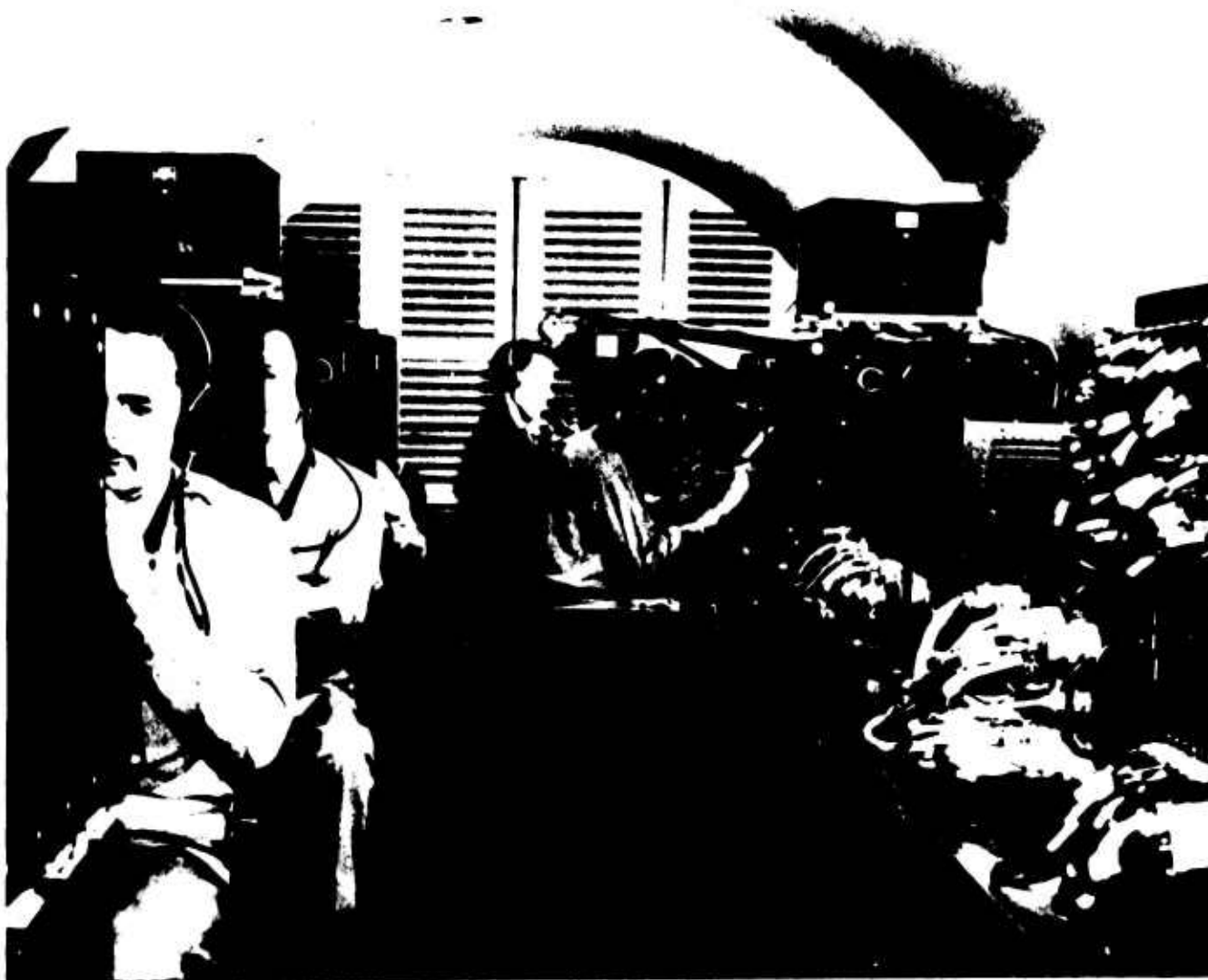
Figure 1 - The CIC portion of the Lockheed P0-2W simulated in the NYU Human Engineering Project laboratory at the Special Devices Center.