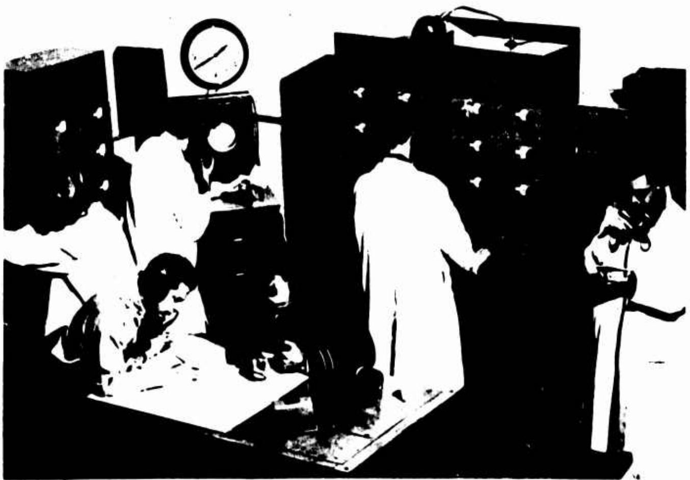
Figure 2 - The experimenters' portion of the NYU Human Engineering Project laboratory showing both the simulator and some of the experimenters' tools.