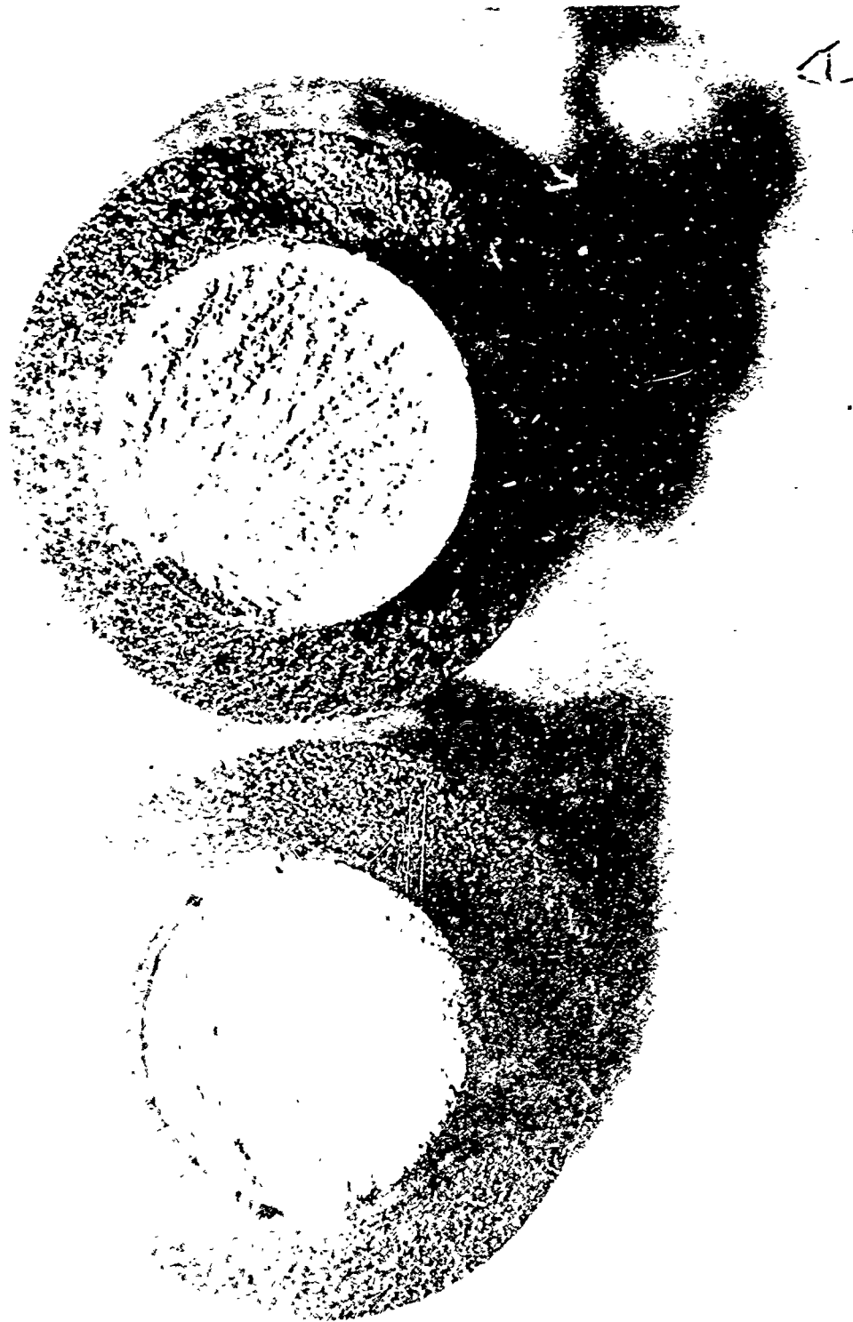
FIGURE 3 1045 STEEL UNBLASTED SURFACE PHOSPHATE COATED. FRACTURE WITH 270,000 PSI LOAD