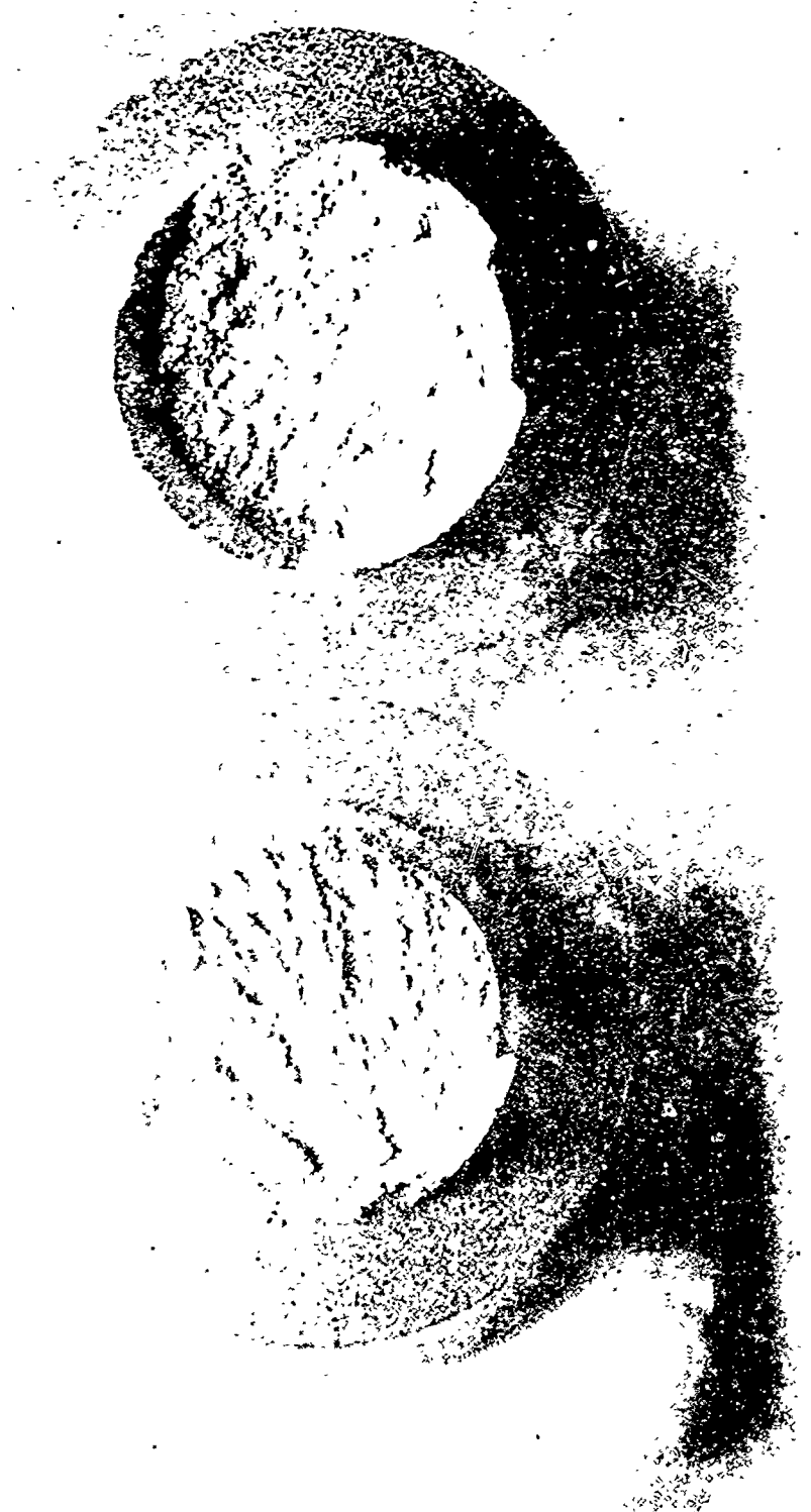
1045 STEEL BLASTED SURFACE PHOSPHATE COATED. FRACTURE IN 30 MINUTES 270,000 PSI LOAD