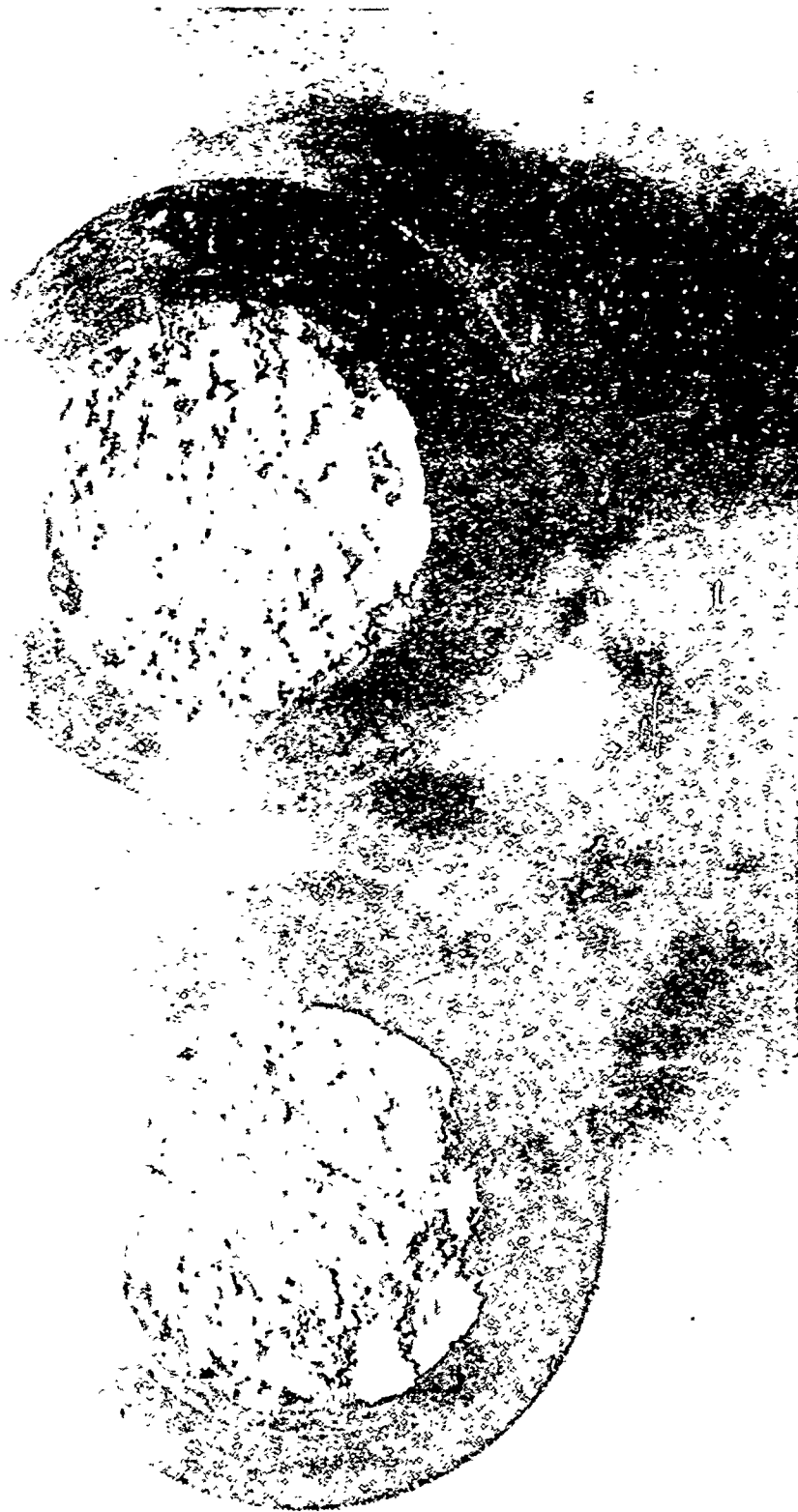
1045 STEEL. FRACTURE SURFACE FROM TENSILE STRENGTH DETERMINATION ON UNTREATED SPECIMEN. (Rc 50 HARDNESS) ULTIMATE STRENGTH 395,000 PSI