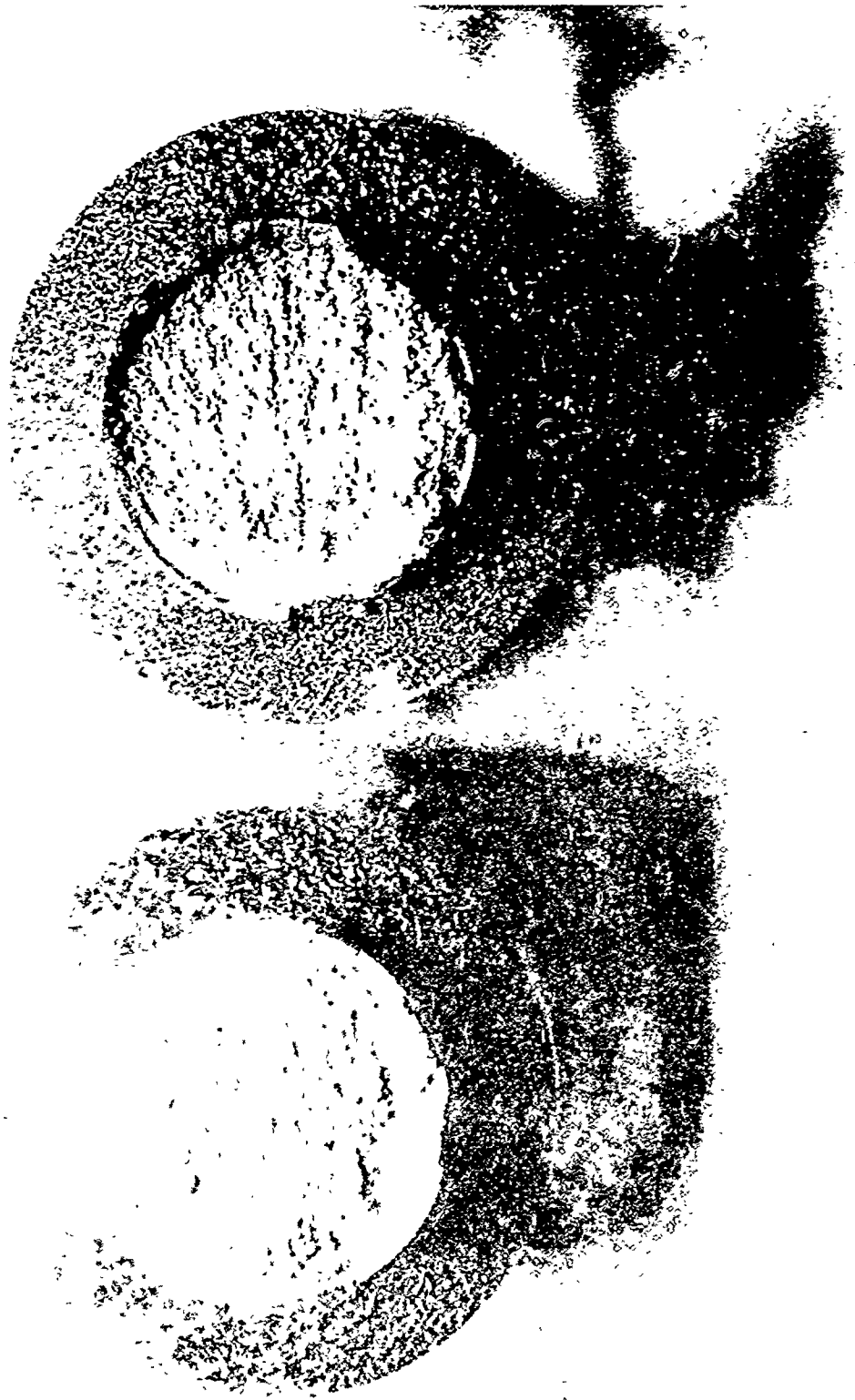
1045 STEEL UNBLASTED SURFACE PHOSPHATE COATED, BAKED 8 HOURS @ 210°F. 270,000 PSI LOAD