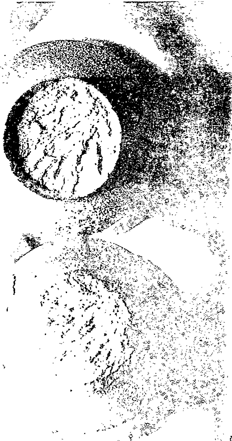
1045 STEEL BLASTED SURFACE PHOSPHATE COATED, BAKED 8 HOURS @ 210°F. FRACTURE LESS THAN 5 MINUTES WITH 270,000 PSI LOAD