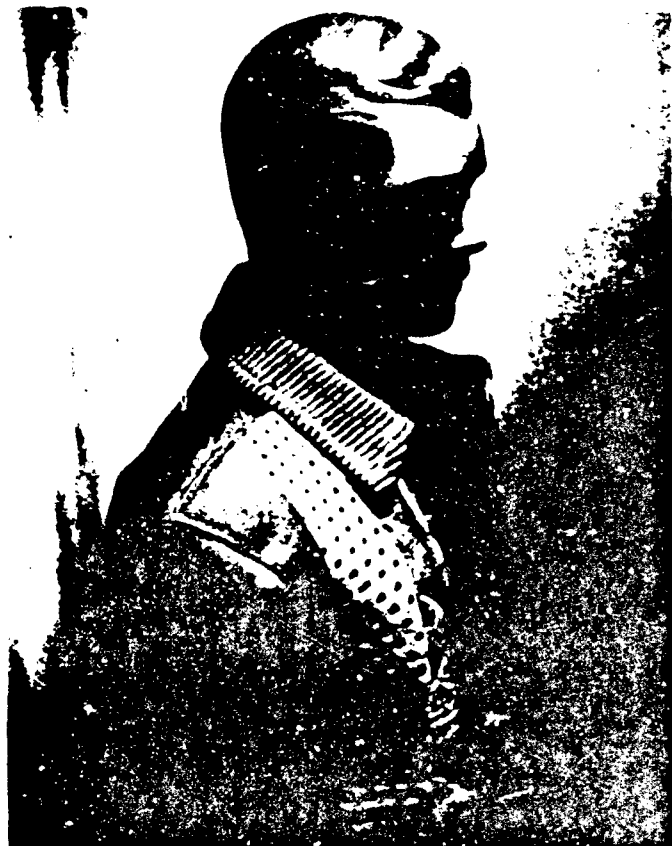
Fig. 2 - Cross-Section of Permeable Jacket showing Perforated Polyvinyl Chloride Foam Insulation.