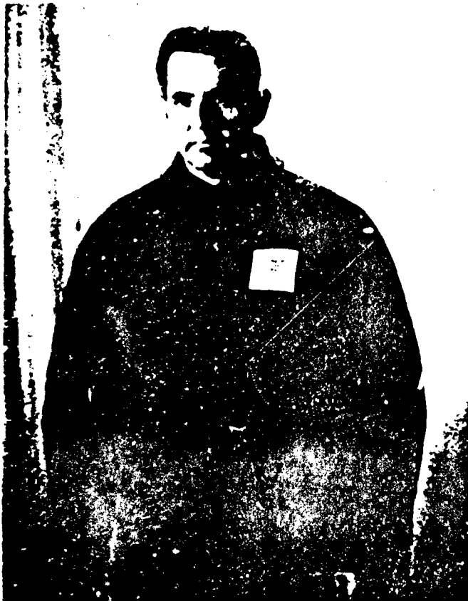
Fig. 1 - Experimental Permeable Cold Weather Jacket (Model I). NAVSUPRANDFAC Photo RT 83-1