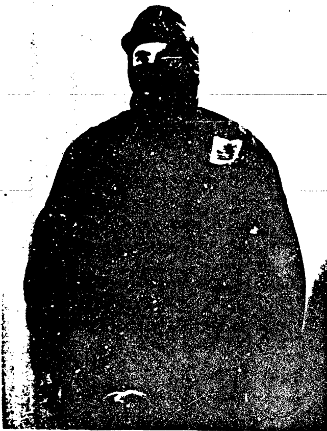
Fig. 3 - Experimental Impermeable Cold Weather Jacket (Model I).