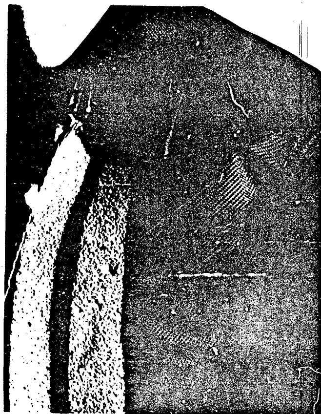
Fig. 4 - Cross Section of Impermeable Jacket Showing Solid PVC Foam Insulation.