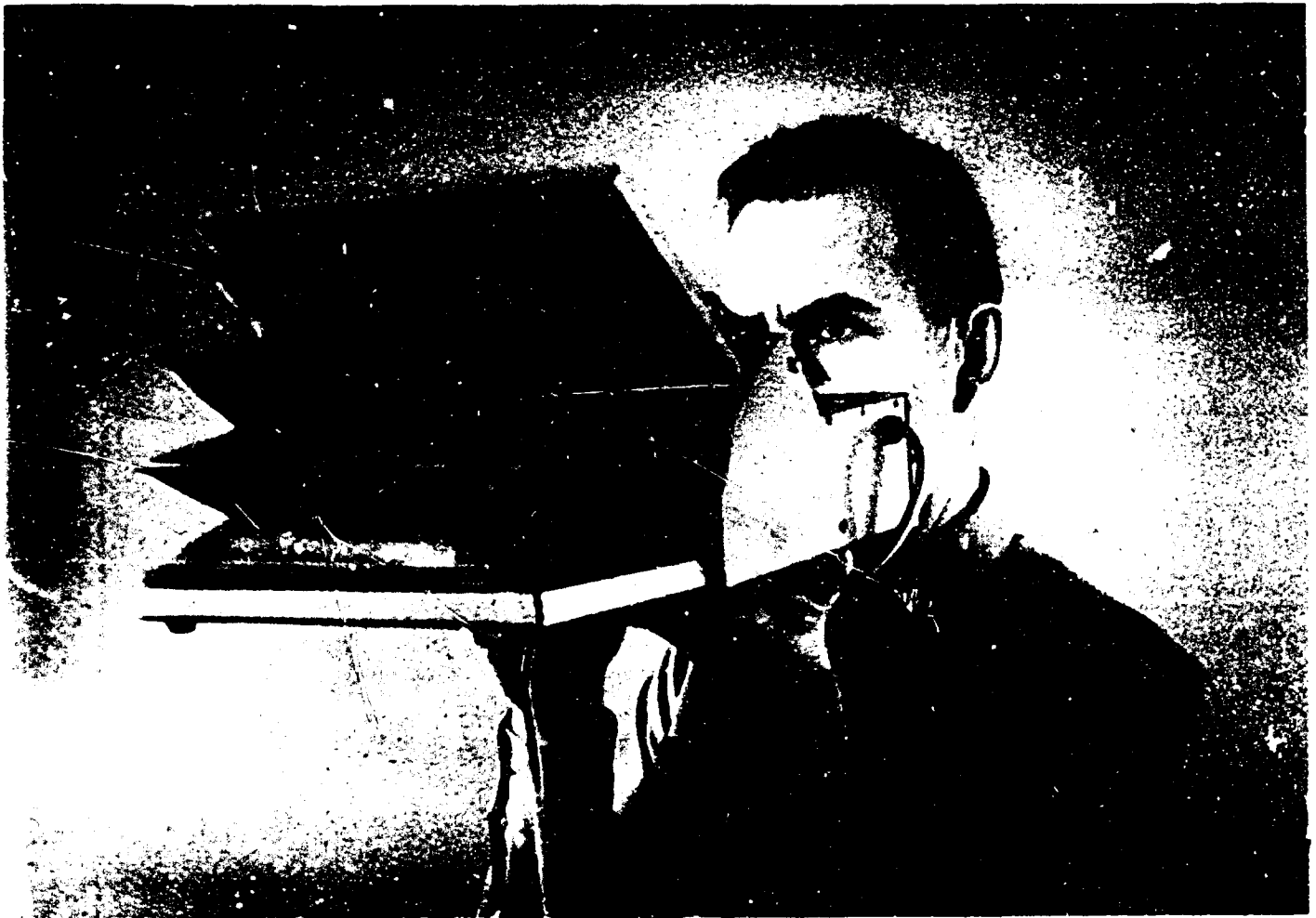
Figure 1. Portable Vital Capacity Test Device ("Vitalor", McKesson Co.).