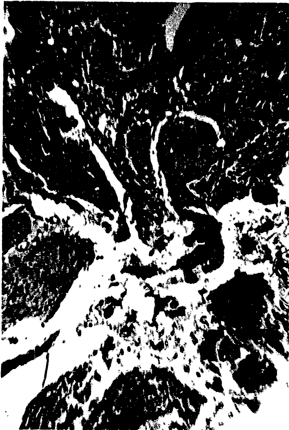
Figure 4. Cluster of Microorganisms contiguous to the ulceration at the crest of an interdental papilla. (CM) Cluster of Microorganisms; (CT) Connective Tissue at Base of Ulcer; (E) Part of the Remaining Epithelium. Orig. Mag. 100X