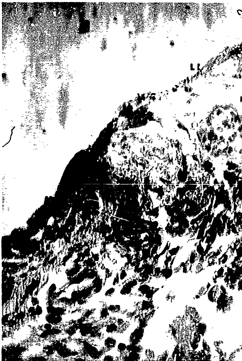
Figure 1. Microorganisms demonstrated along the line of incision. (M) Microorganisms; (LI) Line of Incision; (CT) Connective Tissue of Gingiva. Orig. Mag. 450X