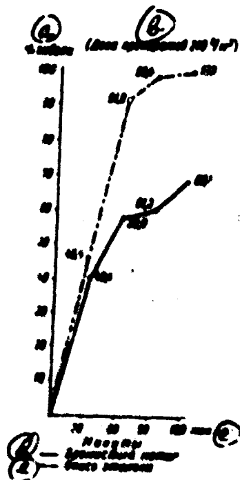
Figure 3. Bactericidal effect of ethylene oxide and methyl bromide on E. coli .

a. % death; b. (Dose of preparation 210 g/m 3 ); c. minutes; d. methyl bromide; e. ethylene oxide.